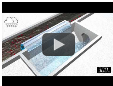
Animation: HUBER Storm Screen ROTAMAT® RoK2 for stormwater discharges with integrated weir

https://www.youtube.com/watch?v=eX4CKg7I3zw