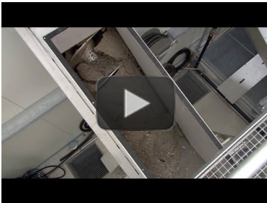
Video: HUBER Grit Treatment System RoSF 5 in disposal industry

https://www.youtube.com/watch?v=a2fl9eGOEsk