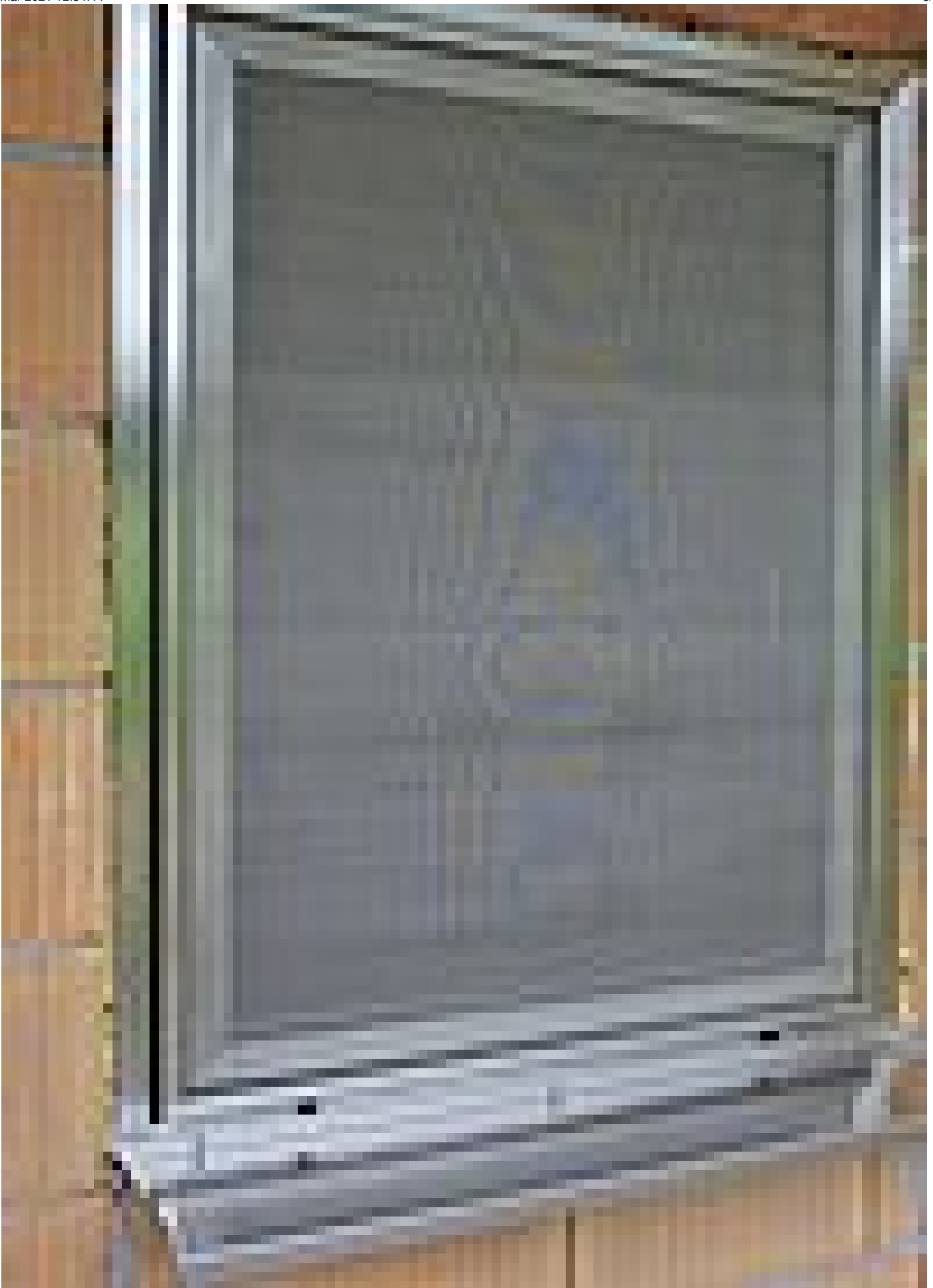
Frame window, rigid, ready for installation, made from two-sheet special 1.4301 (AISI 304) stainless steel profile with intermediate special plastic core to prevent thermal conduction, thermally insulated according to DIN 4108, U_f = 2.70 \text{ W}/(\text{m}^2\text{K}) .