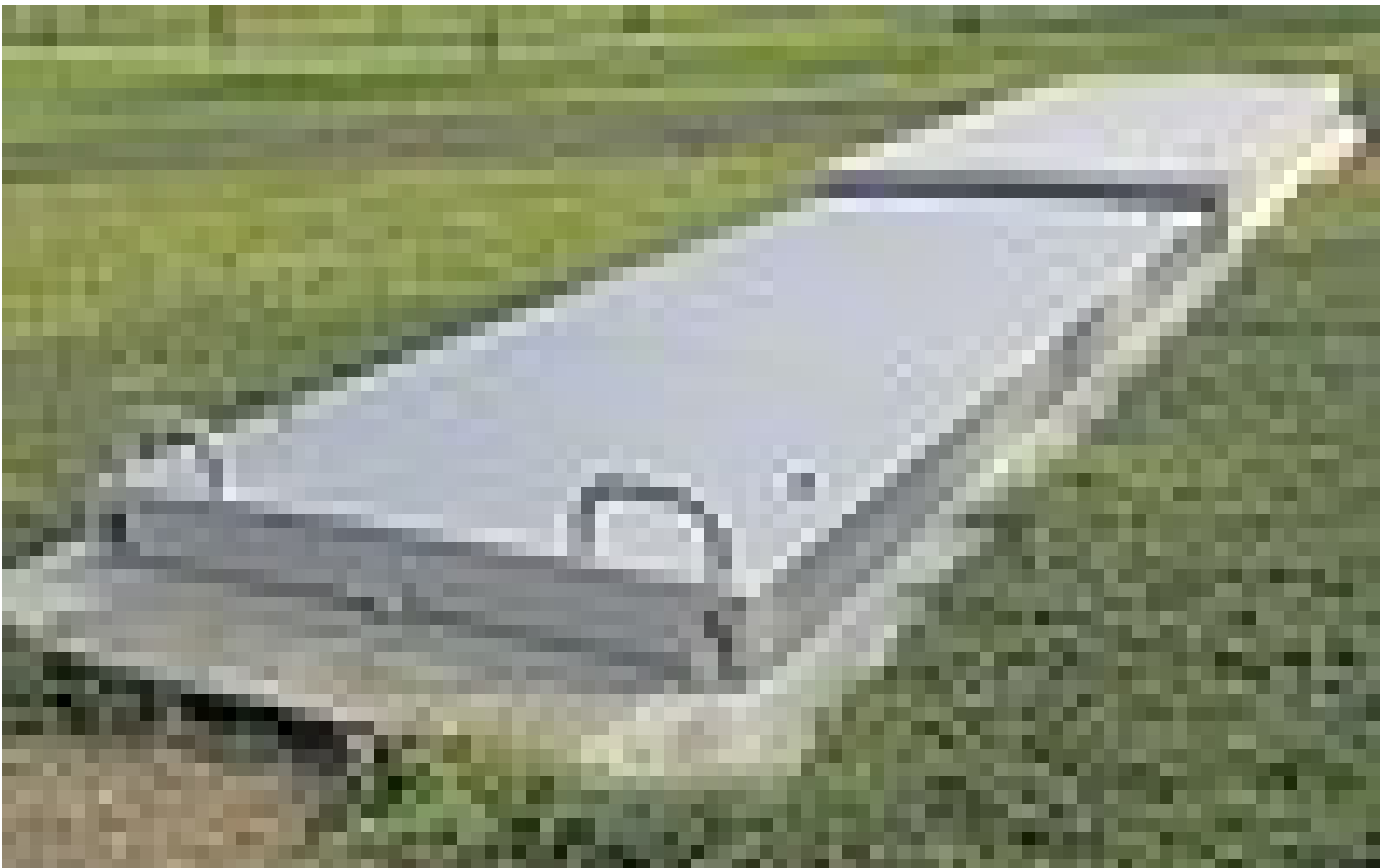
Sliding hatch cover, completely made of 1.4307 (AISI 304 L) stainless steel, with smooth finish.

The sliding cover provides access to downward leading stairs.