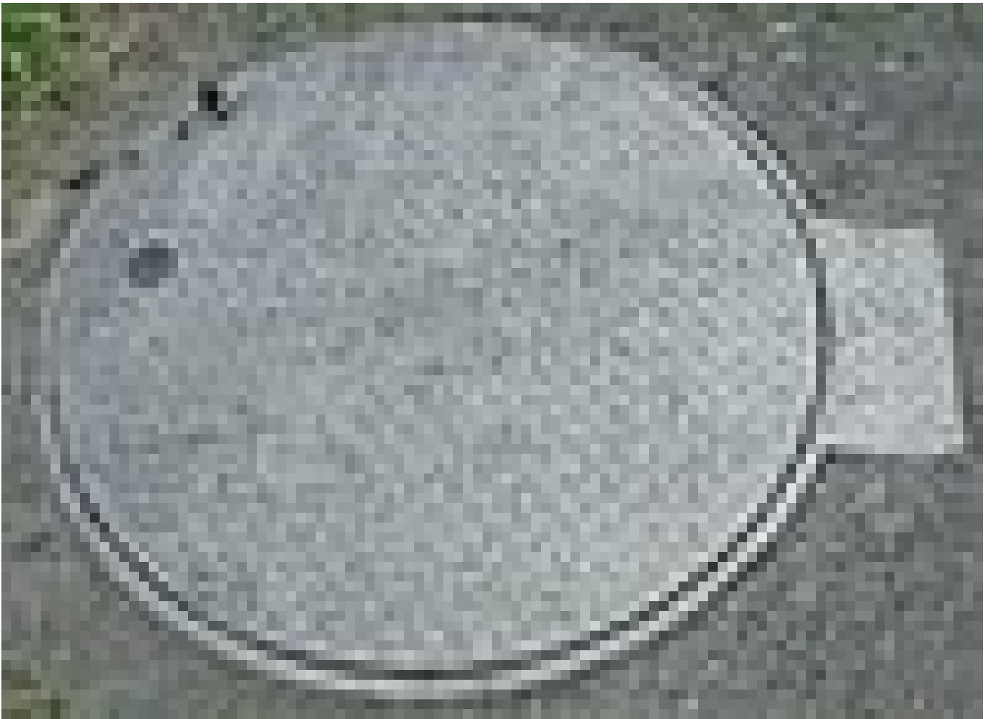
Sliding hatch cover SD12