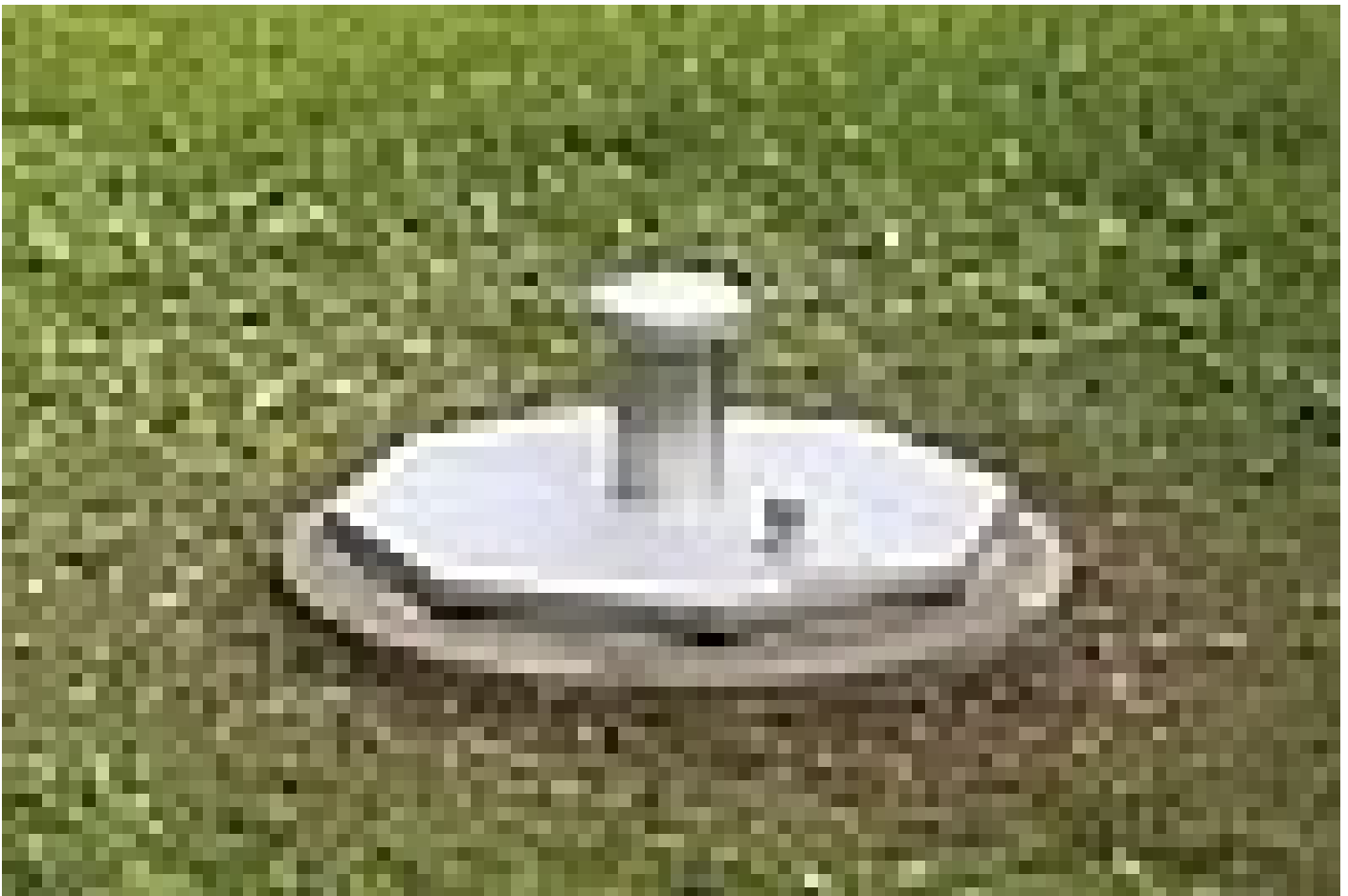
Manhole cover, weatherproof, round in shape, completely made of 1.4307 (AISI 304 L) stainless steel.