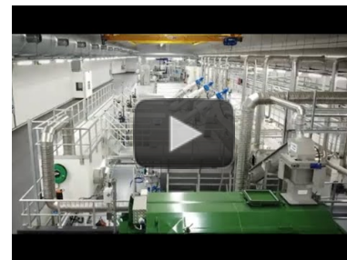
Video: Complete wastewater treatment at the Øygarden WWTP in Norway

https://www.youtube.com/watch?v=60SHSH7XwTg