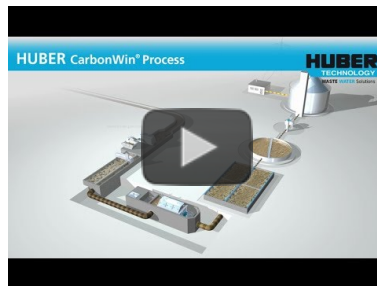
Animation: HUBER CarbonWin@ Process

https://www.youtube.com/watch?v=v-GlfMcQ_nw