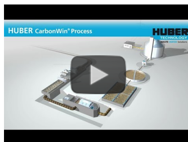
Animation: HUBER CarbonWin® Process

https://www.youtube.com/watch?v=v-GlfMcQ_nw