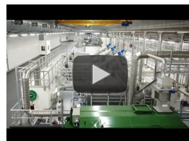
Video: Complete wastewater treatment at the Øygarden WWTP in Norway

https://www.youtube.com/watch?v=60SHSH7XwTg