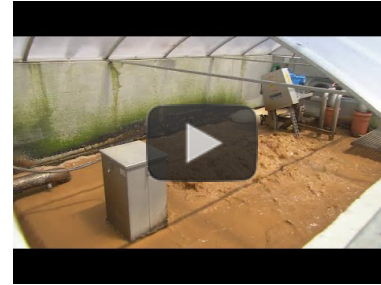
Video: HUBER Membrane Filtration VRM® - here bioreactor in beverage industry https://www.youtube.com/watch?v=T5sOUqy-zxk