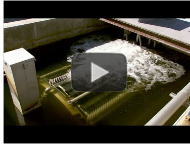
Video: HUBER Membrane Filtration VRM® - bioreactor in meat processing industry https://www.youtube.com/watch?v=dEGT0qbIBWE