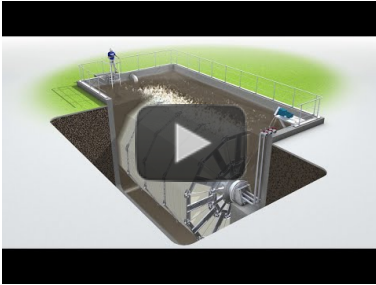
Animation: HUBER Membrane Filtration VRM® https://www.youtube.com/watch?v=iLMNWK14xfk