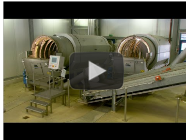
Video: HUBER Grit Treatment System RoSF 5 at major WWTP "Emschermündung"

https://www.youtube.com/watch?v=ZVP2aWdm9AE