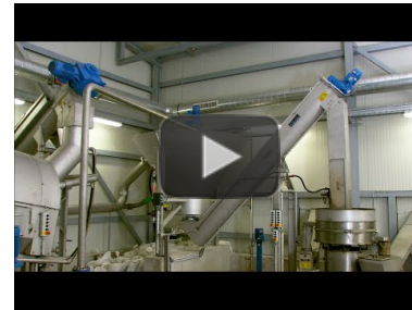
Video: HUBER Grit Treatment System RoSF 5 - grit recycling at WWTP Schwarzenberg

https://www.youtube.com/watch?v=SpqkL361Sc