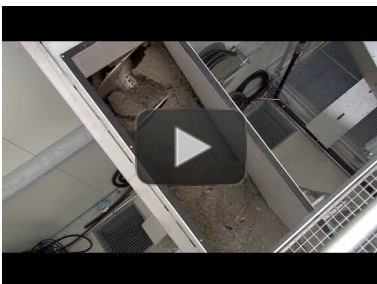
Video: HUBER Grit Treatment System RoSF 5 in disposal industry

https://www.youtube.com/watch?v=a2fl9eGOesk