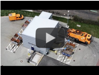
Video: HUBER Grit Treatment System RoSF5 at WWTP Frankfurt-Niederrad

https://www.youtube.com/watch?v=ZVP2aWdm9AE