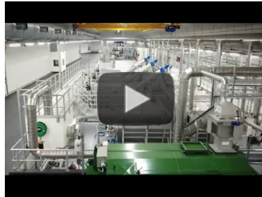
Video: Complete wastewater treatment at the Øygarden WWTP in Norway

https://www.youtube.com/watch? v=BKPMhiNjmRI