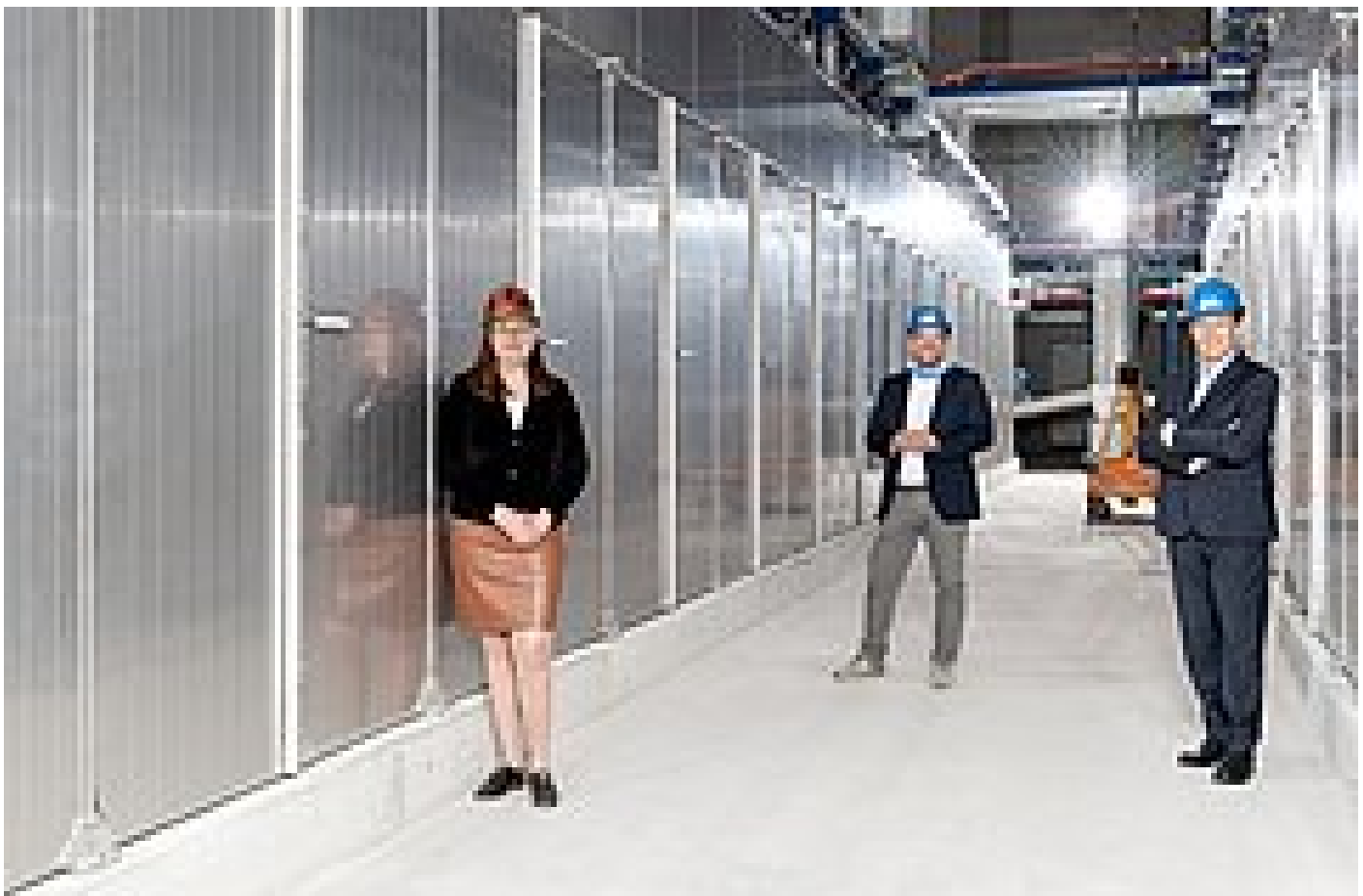
Official start of commissioning on 23 April 2020 by the management and the Lord Mayor began during a press meeting on site

In case of maintenance, the dried sludge can be conveyed from the two belt dryers into a container with a capacity of approx. 20 m 3 . This container can be transported away directly afterwards with a hook lift vehicle.