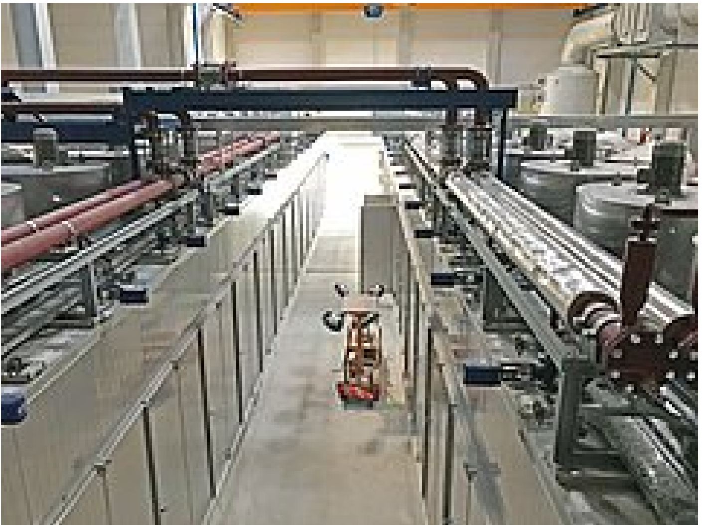
The installation work shortly before completion

fluctuating inlet temperatures in the district heating network, to which the dryers are directly connected without hydraulic separation. The direct connection to the district heating network gives the power plant operator the option of using the dryer as a heat sink. In the