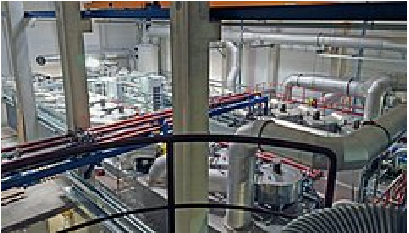
A part of the drying plant, view from intermediate storage tank