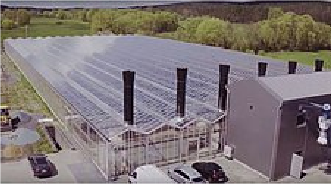
Aerial photo of the sludge drying plant in Bayreuth

The double shovel can however also be used to selectively displace the sludge. For this purpose the SRT sludge turner takes up sludge into one of its shovels and places the sludge turning tool into horizontal position. The HUBER SRT can thus not only backmix dry sludge into wet sludge, it also provides the possibility to feed wet sludge and remove dry sludge on the same side of the dryer, like it is the case on the Bayreuth site.