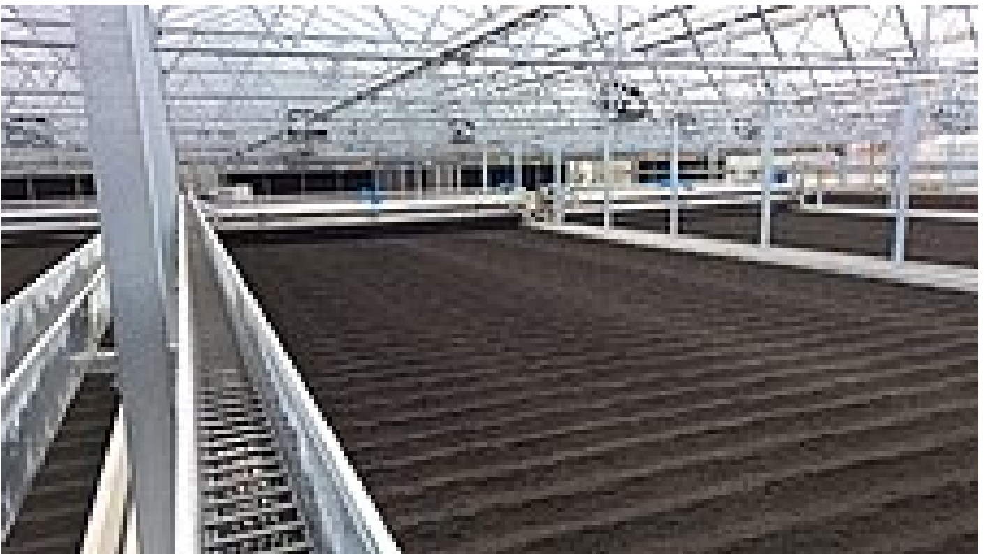
The sludge turner in the one-way road: The dry granulate is returned to the machine building