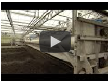
Video: HUBER Sludge Turner SOLSTICE®

https://www.youtube.com/watch?v=QdWhhrCOkug