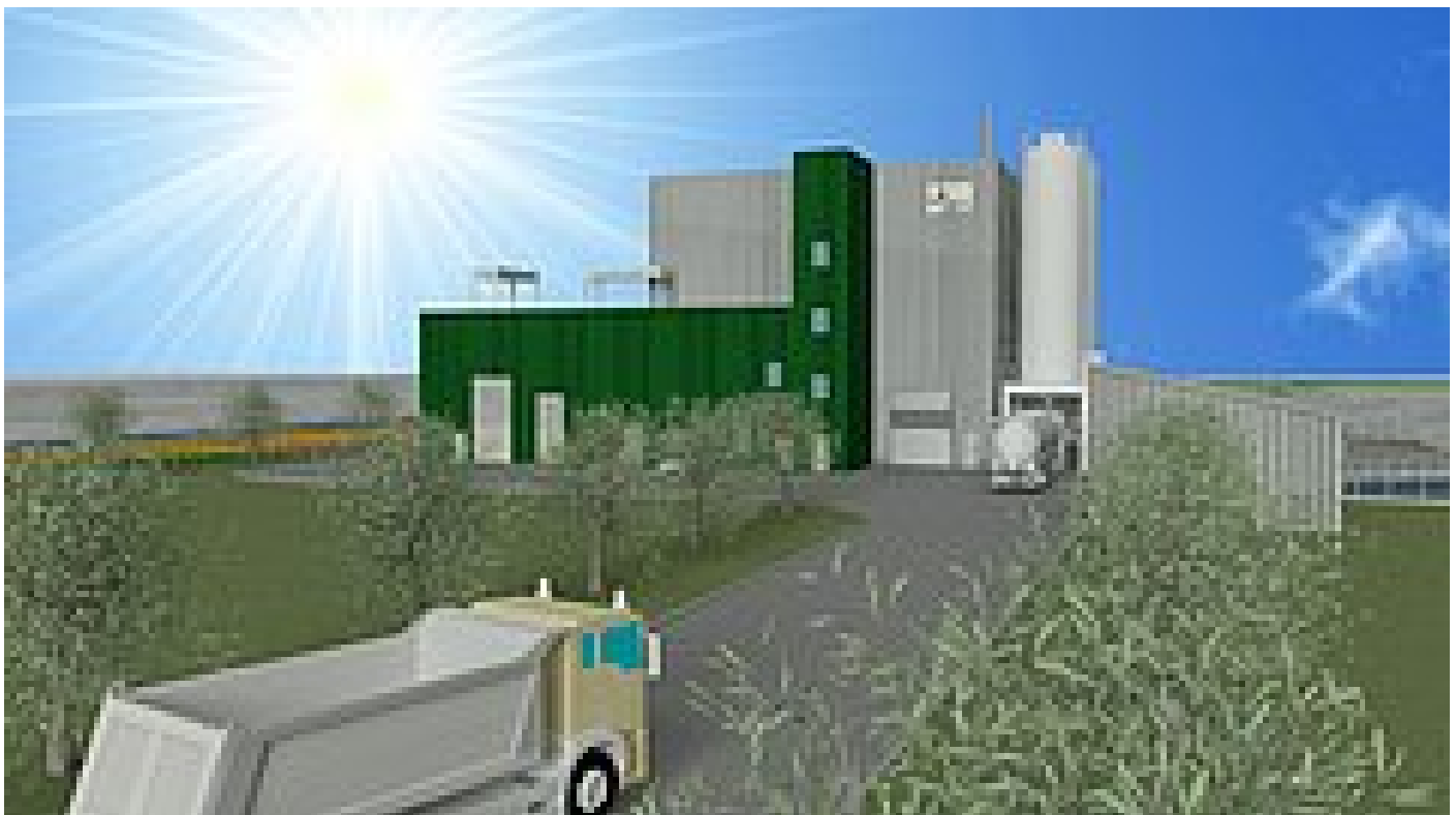
Preview of the complete plant for sewage sludge utilisation at Halle-Lochau (rendering)

Since the Waste Sewage Sludge Ordinance came into force, many plant operators and sludge disposal companies are increasingly looking for alternatives to spreading the sewage sludge on land and for solutions to recover nutrients. By 2013, sewage plant operators have to present a report about which measures they intend to take to recover phosphorus and how they plan to manage the disposal of their sewage sludge in the future.