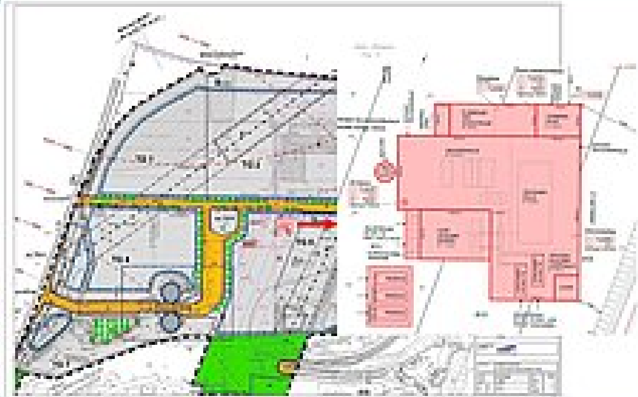
Extract from the application for the provisional decision - layout plan

At the sewage sludge utilisation plant Halle-Lochau, both dewatered sludge (25% DS) and externally fully dried municipal sludge (90% DR) will be treated thermally in the future. The plant is designed to ensure that both 33,000 tons of dewatered sewage sludge and 2,700 tons of externally dried sludge can be utilized.