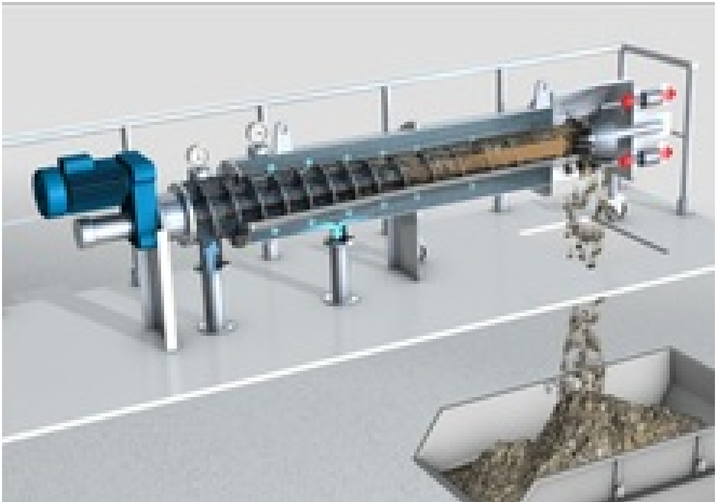
HUBER Sludgecleaner STRAINPRESS® 290

For the sludge thickening, the sludge was a mixture of primary and SAS and the requirement for the throughput was 96.72m 3 /hr at a 1% D.S. with both thickeners in operation. A dry solids of >6% was required for the outlet.