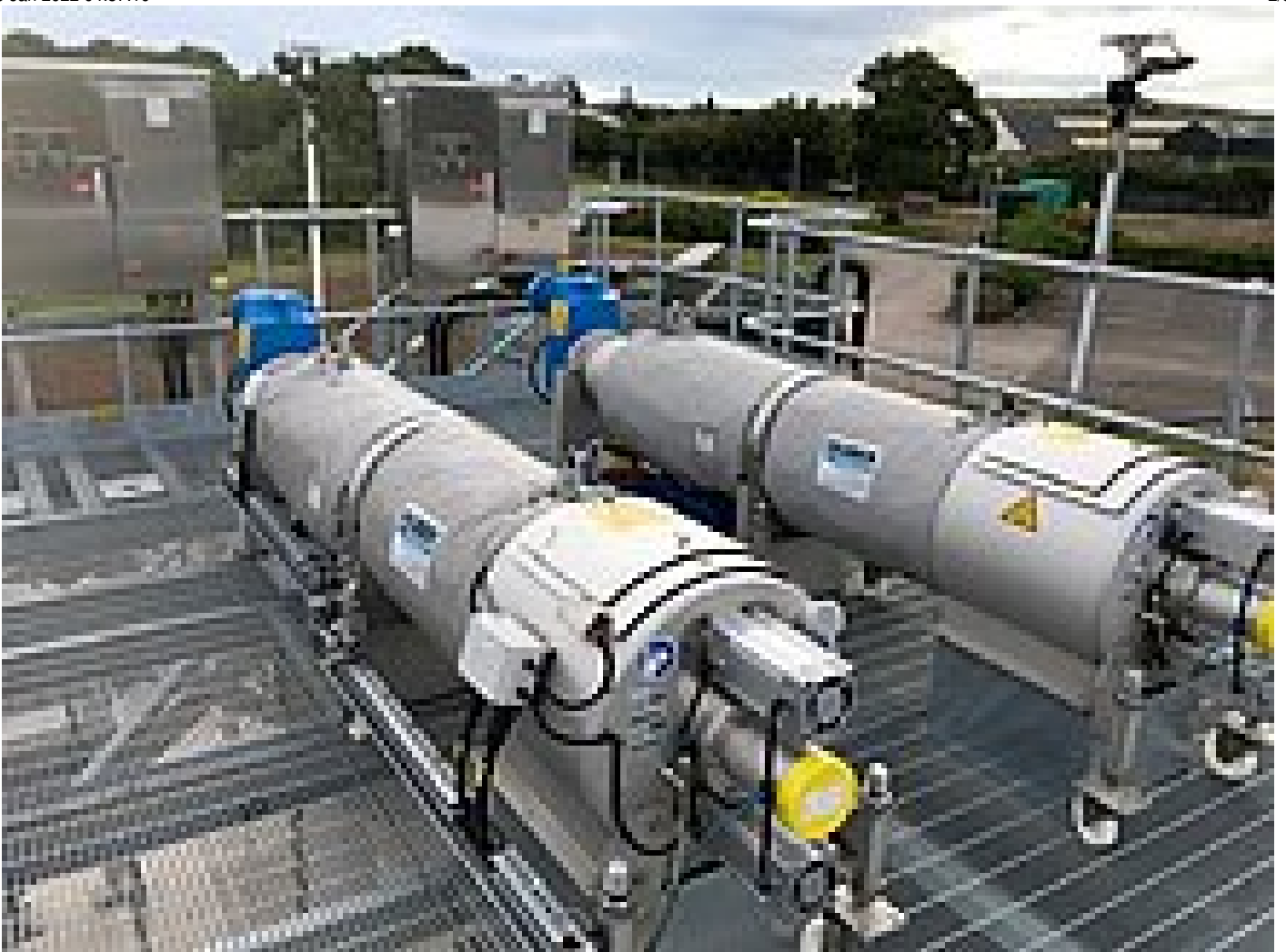
Cannock STW installation with HUBER Sludgecleaner STRAINPRESS®