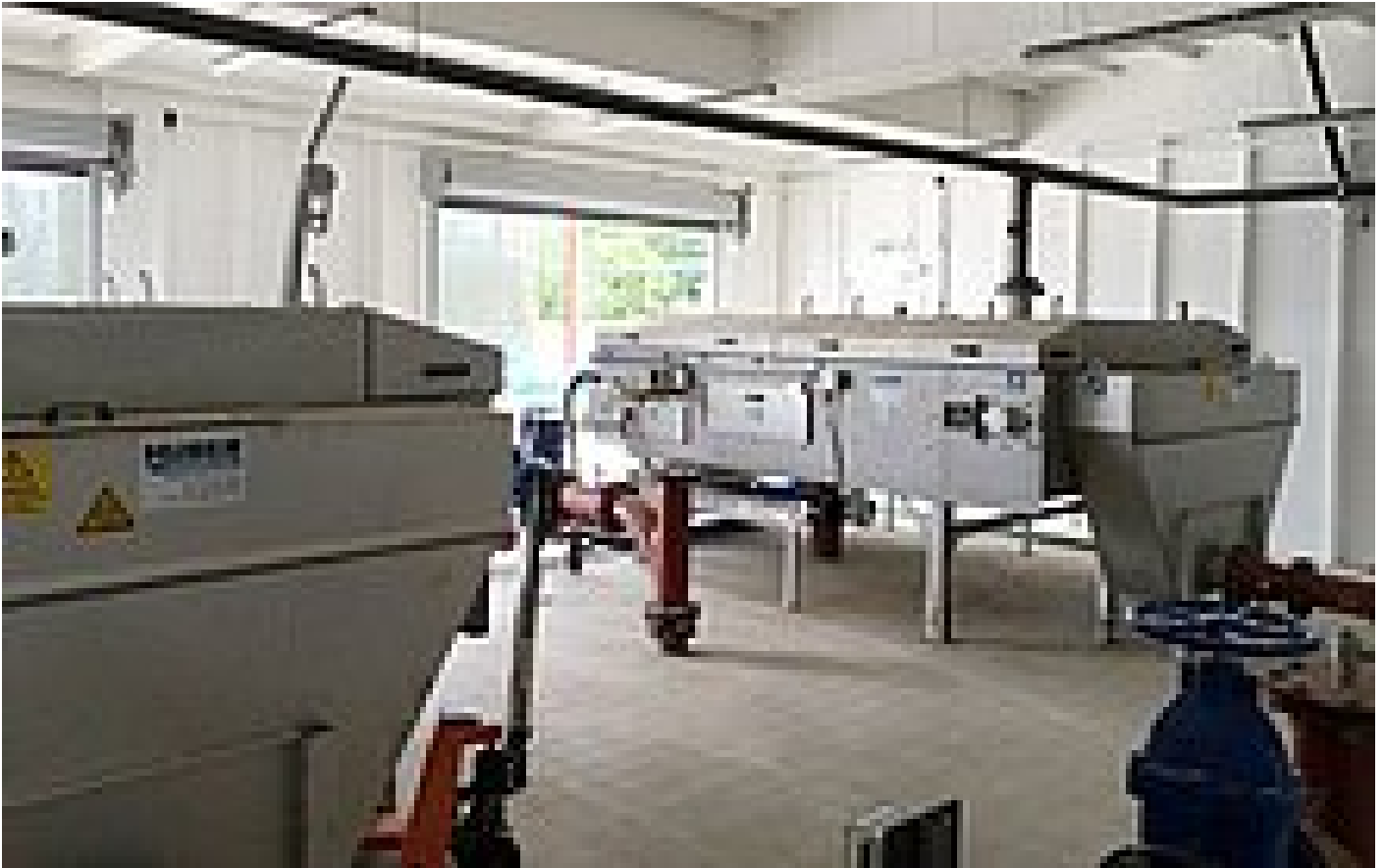
Cannock STW installation with the HUBER Belt Thickener DrainBelt