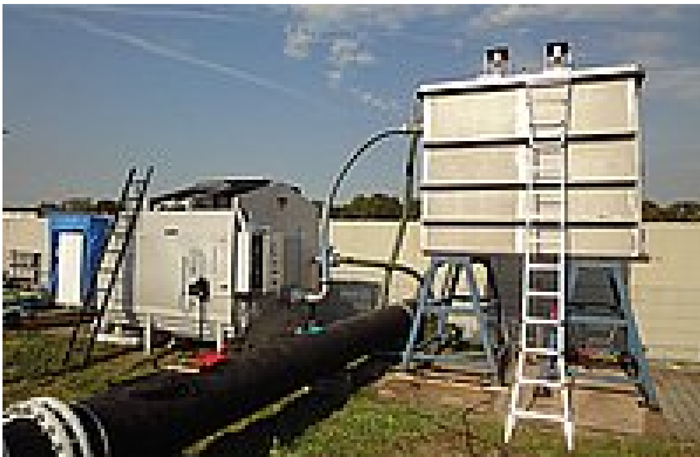
RoDisc® pilot plant with upstream flocculation reactor on STW Mannheim

Increasing loads of pharmaceutical residues, industrial chemicals and hormones are discharged to our waters. To counteract this development, these substances must be removed from the wastewater as effectively as possible. The combined use of powdered active carbon and the HUBER RoDisc® Rotary Mesh Screen provides a solution which ensures that the substances to be eliminated are absorbed on the surface of the powdered active carbon and reliably separated from the wastewater flow by the downstream RoDisc® screen.