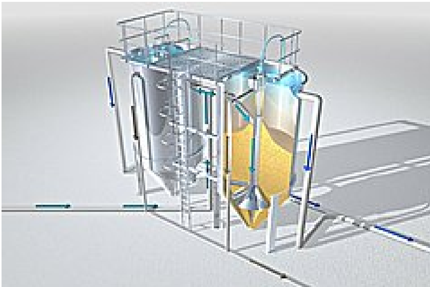
Fig. 1: Operation principle of the HUBER Sandfilter CONTIFLOW®

Pharmaceutical residues are increasingly found in water and soil in Germany. Due to improved methods of analysis a great number of pharmaceuticals can today be detected in surface waters and sometimes also in groundwater, in the concentration range of nanogram to microgram per litre. Due to their very low concentrations these substances are also called micropollutants or trace substances.