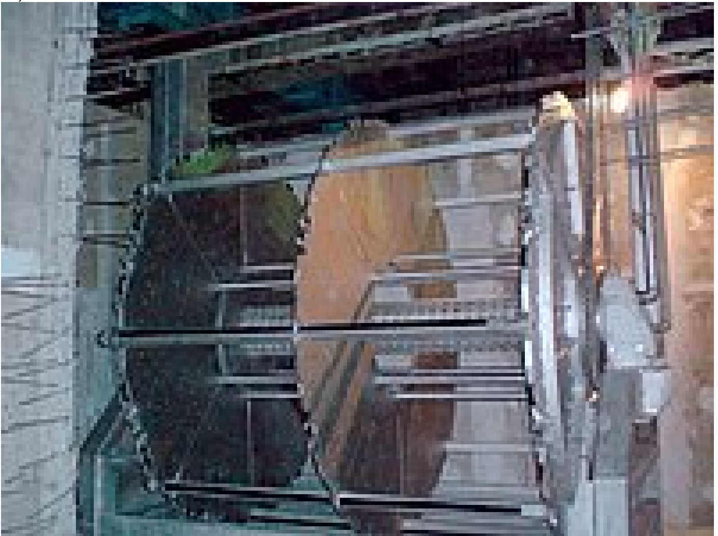
Assembled unit with the membrane modules still missing

Shipping equipment in parts is nothing new to HUBER, but reassembling all pieces of two big VRM (Vacuum Rotation Membrane) 30/268 units on site was a challenging first! The two VRM membrane units serve for the upgrading of an existing conventional waste water treatment plant underneath a shopping mall. The capacity of the plant needs to be increased because of an expansion of the shopping mall. The treatment plant is located in its 3rd floor basement.