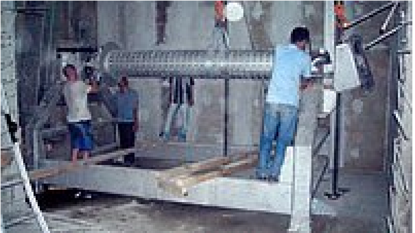
Assembly of the first VRM unit inside the filtration chamber