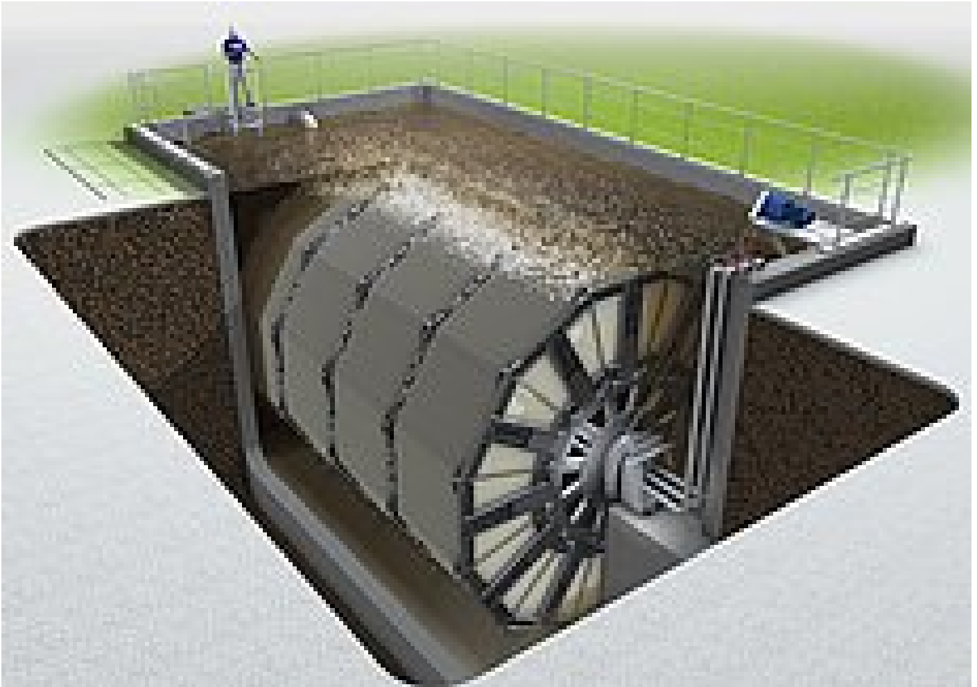
Sketch of the new HUBER Membrane Filtration VRM®

Press release: New HUBER Membrane Filtration VRM®