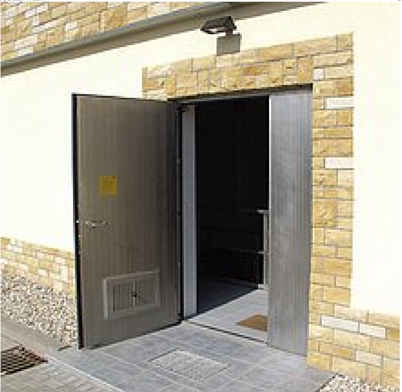
Attack-proof security door TT2, certified to resistance class RC3

The resistance value in time is the time an expert needs to break a mechanical barrier with the use of appropriate tools. In connection with burglar alarm systems, the resistance value in time is the time between alarm release and burglary. This time should be longer than the time the action force needs to reach the place of attack for intervention. Besides, the offender will probably stop the burglar attempt if the barrier is too resistant.