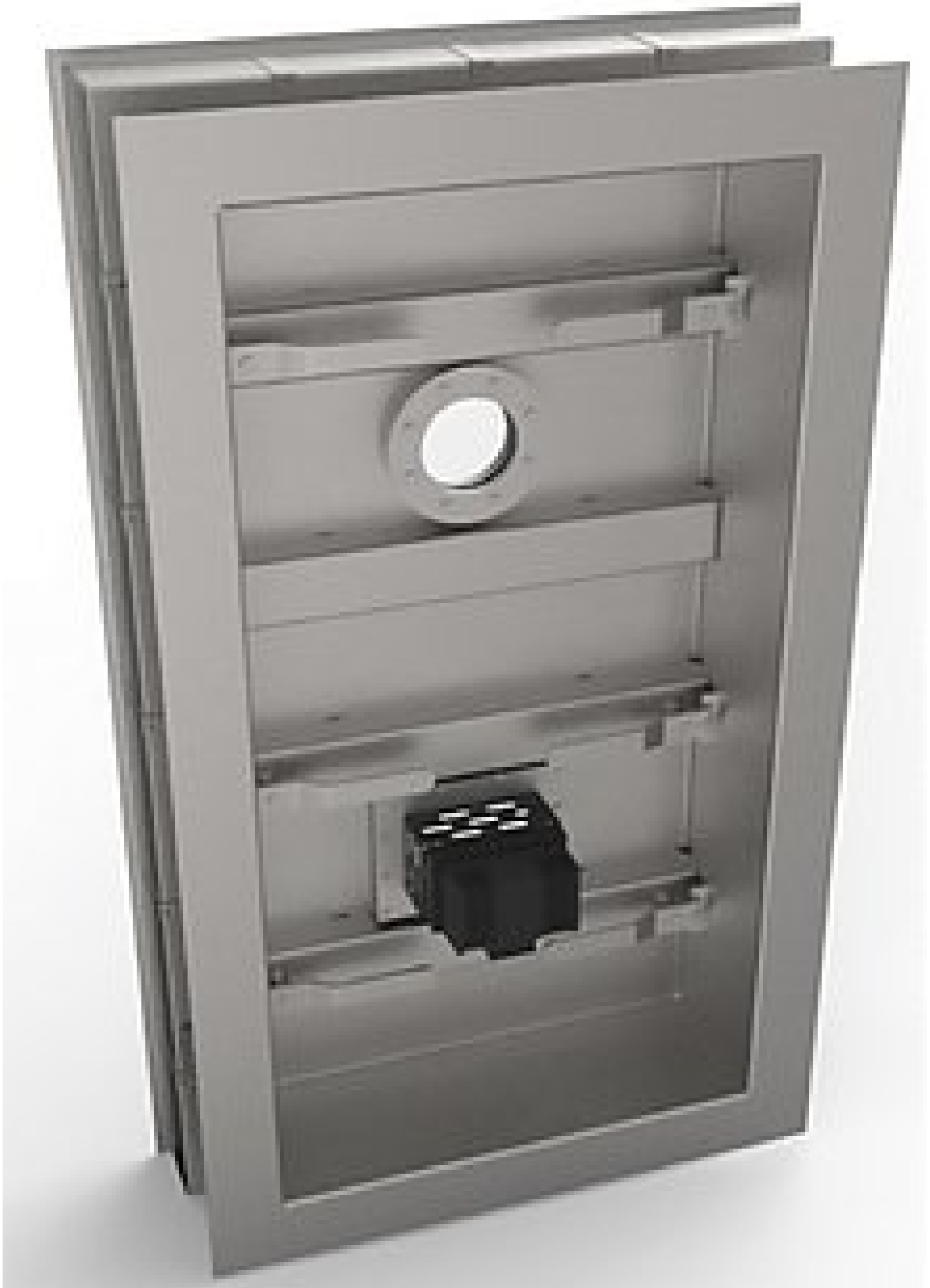
HUBER pressure door TT7 with inspection window and spotlight