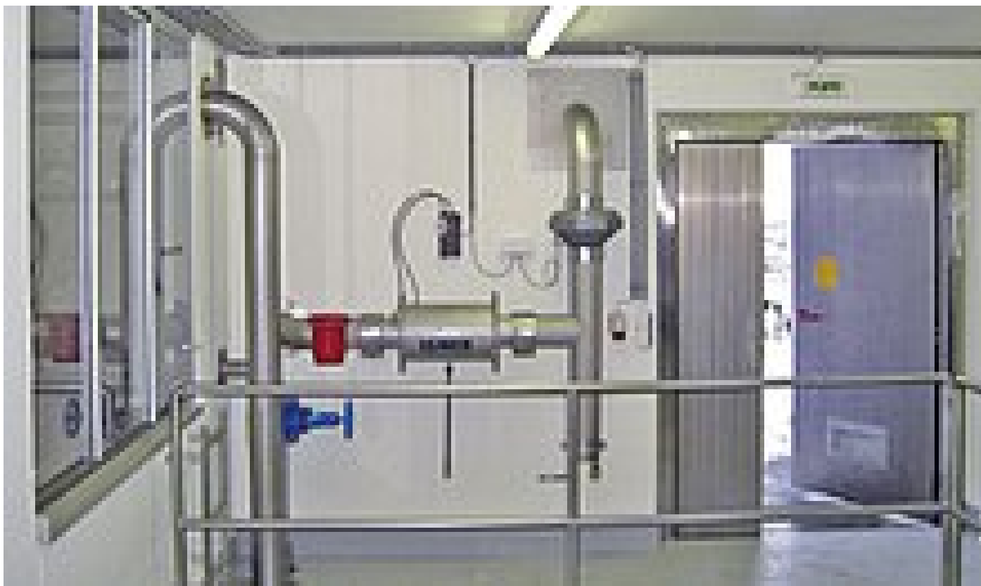
Installation example of "active forced ventilation" in the elevated reservoir Utzenaich, Austria

Drinking water supply structures are in most cases erected by construction companies as principal contractor. When construction companies receive the order for building a drinking water reservoir, they need a partner who can supply both high-quality products and the expertise required to provide economical solutions with maximum customer satisfaction.