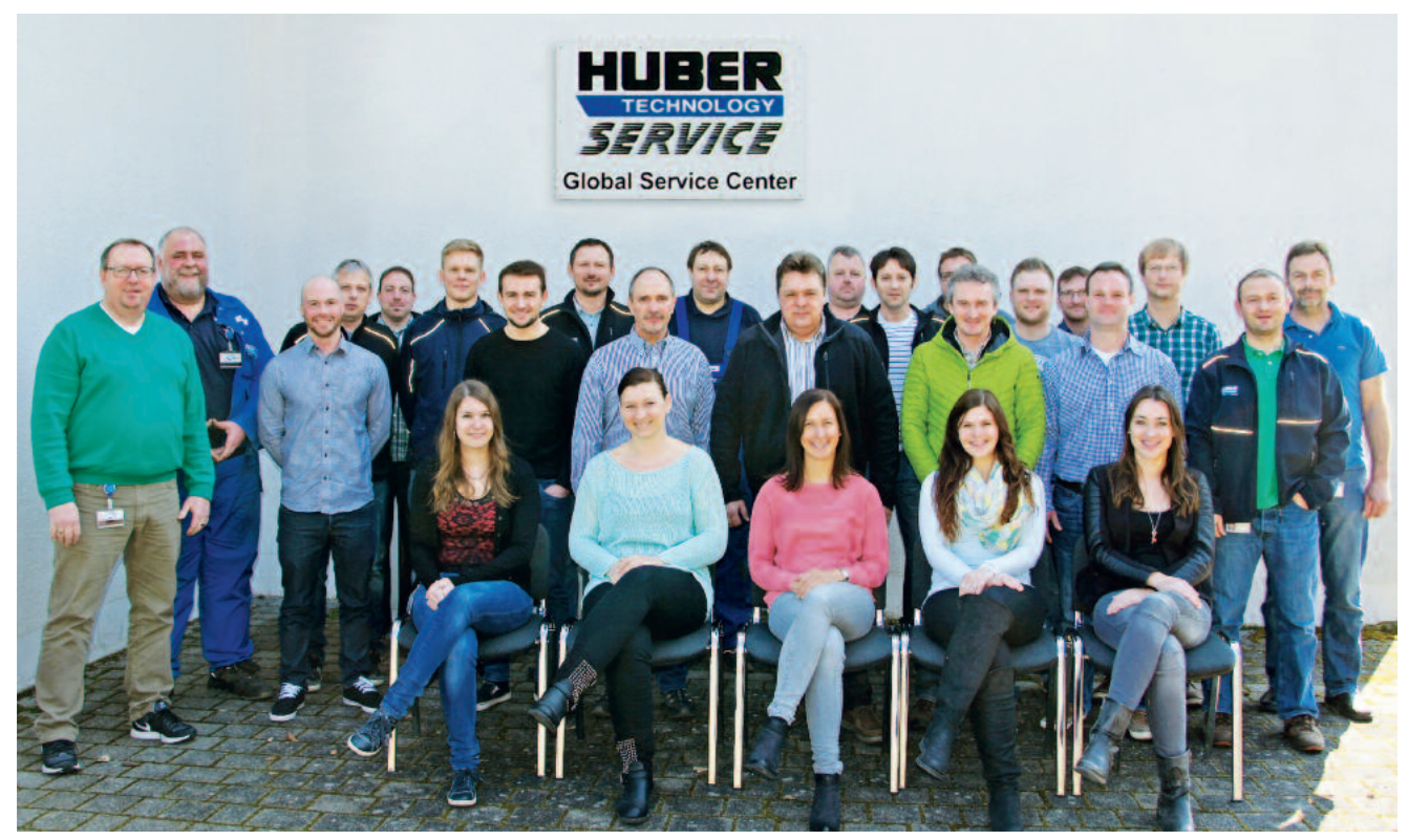
The goal of our competent service team: optimum equipment operation – worldwide