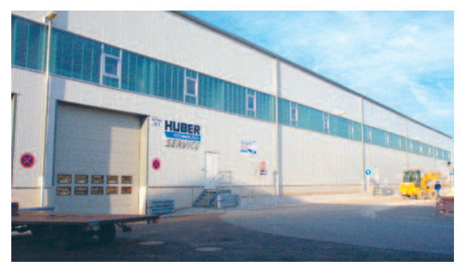
HUBER repair service factory

E-mail: service@huber.de Fax: (0 84 62) 201 - 459 Phone: (0 84 62) 201 - 455