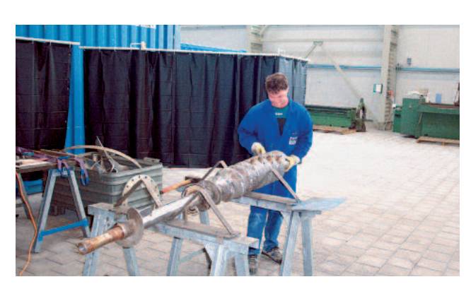
Overhaul of a used screw shaft