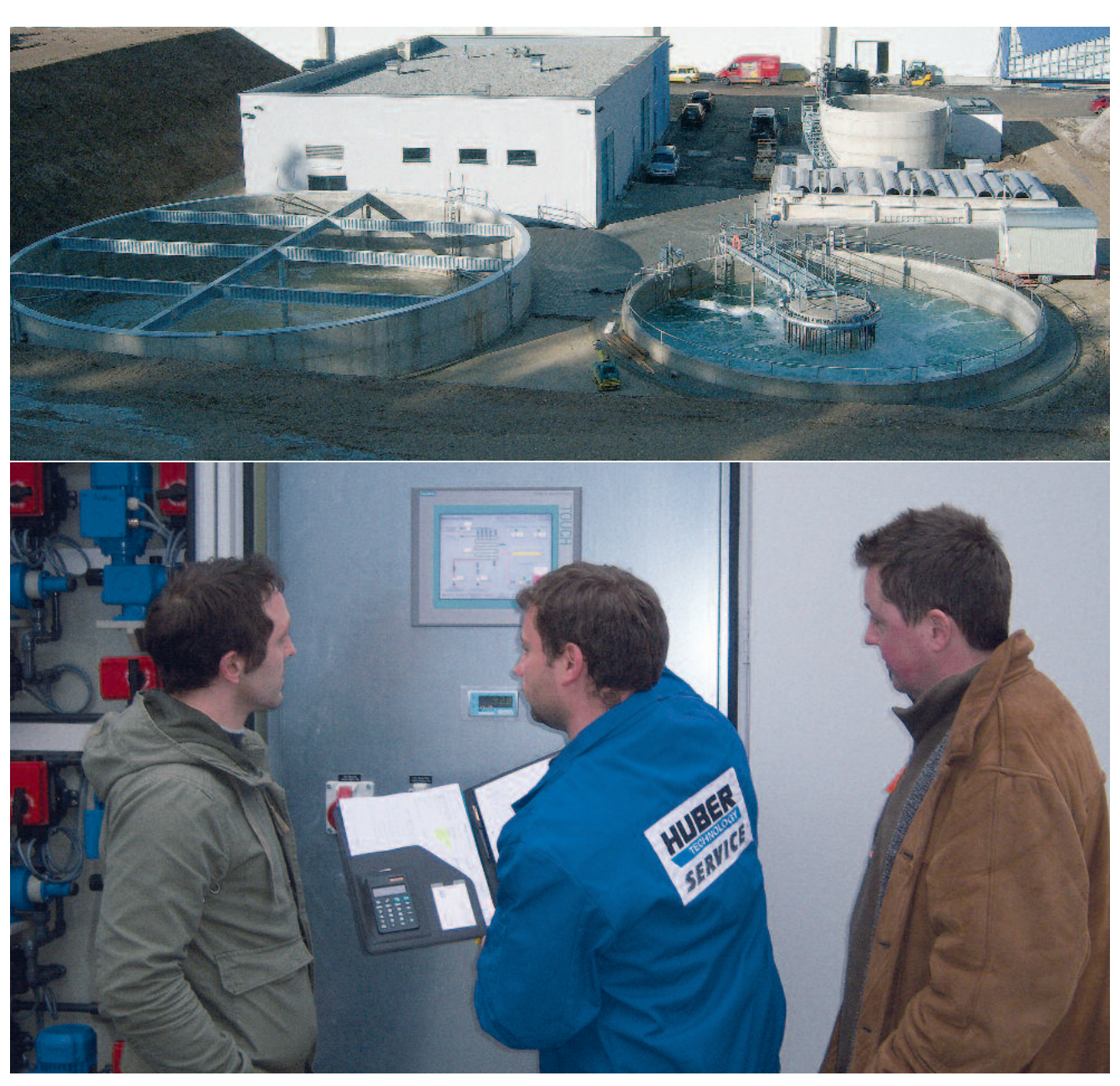
HUBER Service for control and monitoring of the customer's wastewater treatment plant – support and training of operating staff on site

operative work on site or, depending on the selected scope of services, additional parallel monitoring of the machines by our HOC system, in any case continuously providing maximum expertise for customers and their plants, even directly on site.