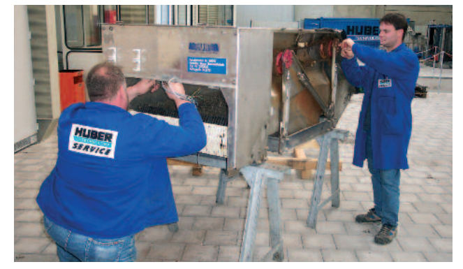
The factory repair team: repair and maintenance of a machine from another step screen manufacturer