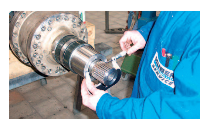
Certified service quality – with guarantee!