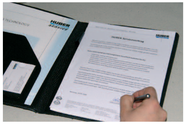
HUBER service and maintenance contracts for increased safety and economic efficiency