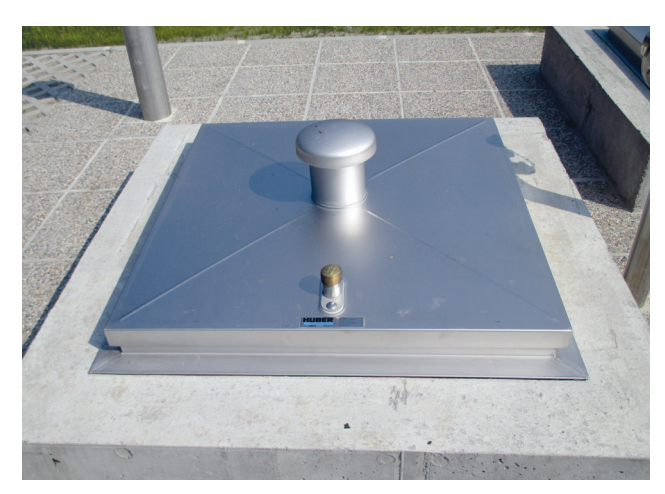
The figure shown here may contain special accessories

Manhole cover, weatherproof, rectangular in shape, completely made of 1.4307 (AISI 304 L) stainless steel.