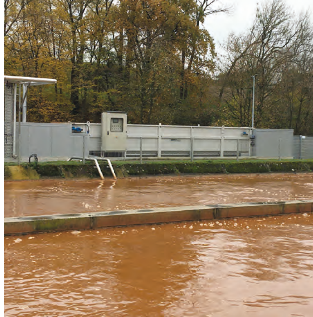
HUBER Dissolved Air Flotation systems for sludge separation and effluent treatment – the solution for upgrading overloaded wastewater treatment plants.