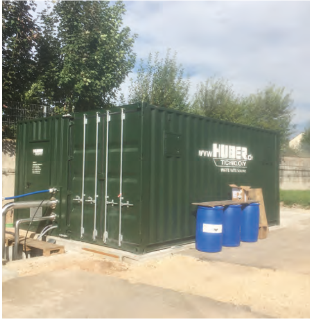
HUBER plant technology in container design – flotation or sludge dewatering units without construction work – ready for immediate use.