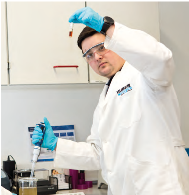
Preliminary tests in the laboratory or on site to determine operating parameters and effluent values – safety for customers and operators.