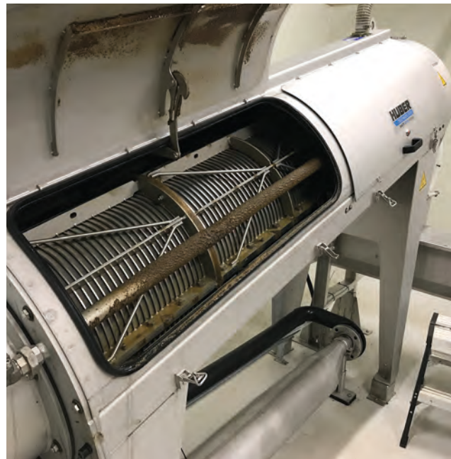
HUBER Screw Press for dewatering of residual sludge from onshore fish farms (salmon production) – reduced disposal costs.