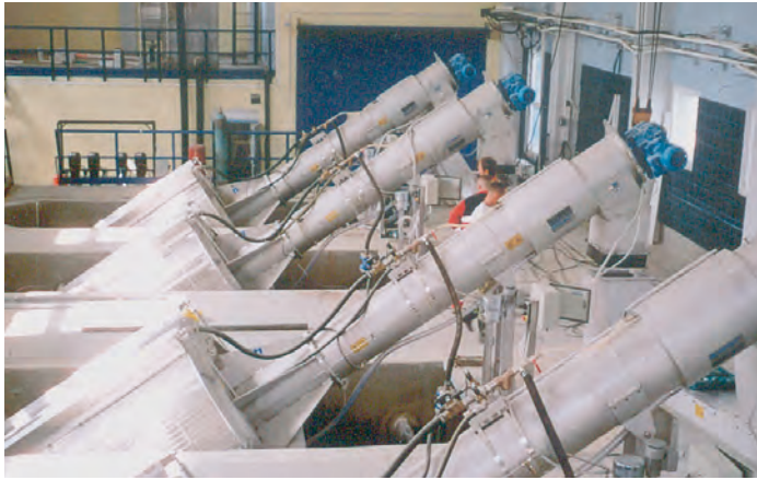
HUBER screening systems for mechanical pre-treatment – efficient, durable and well proven.