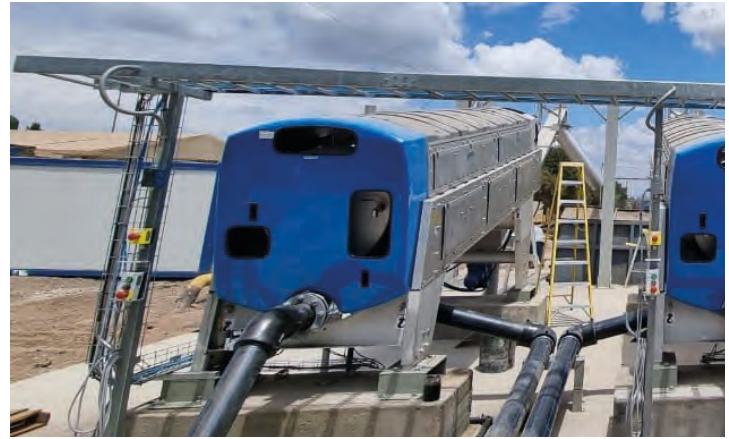
HUBER Screw Press units for sludge treatment – best dewatering, costs.