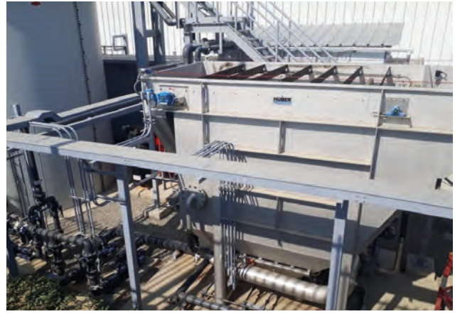
HUBER Dissolved Air Flotation for physical-chemical pre-treatment – optimum reduction of COD, fats and solids, more than 500 installations worldwide.