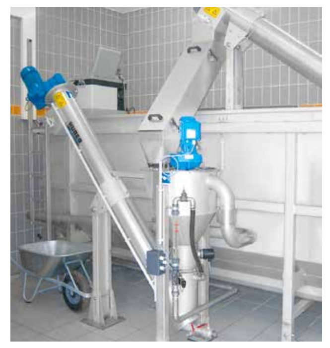
A small HUBER Grit Washer RoSF4 TC washing the classified grit from a HUBER Complete Plant ROTAMAT® Ro5.