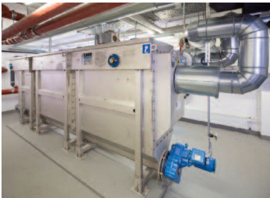
HUBER Heat Exchanger RoWin at Klinikum rechts der Isar