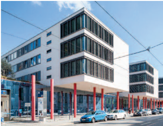
University hospital Klinikum rechts der Isar

Use the chance to see first-hand an innovative concept for energy and CO 2 saving and get an idea of which potential could be hidden also in your plant!