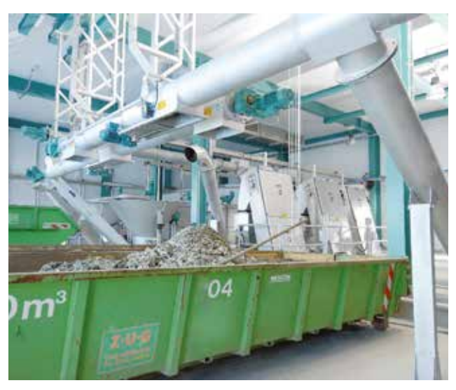
HUBER Screw Conveyor Ro8 V as container distribution solution.