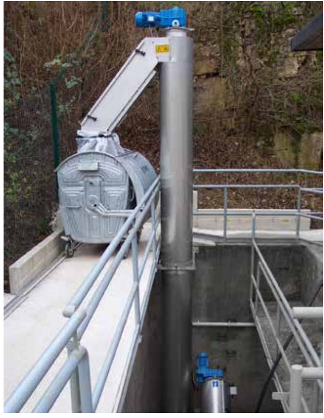
Vertical discharge of screenings from a micro strainer out of a deep manhole.