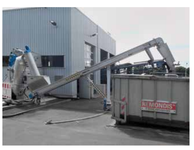
Rotating Screenings Distribution Screw Ro8 TC.