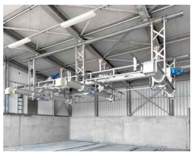
Ceiling-mounted distributor for disposal of dewatered sludge in containers.