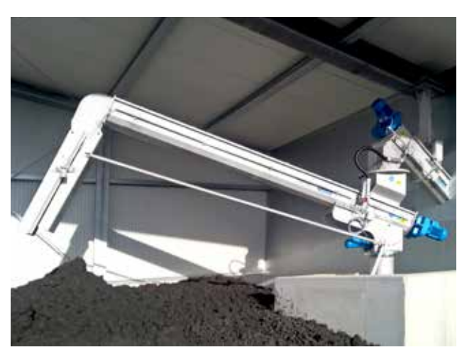
Rotating Distribution Screw Ro8 TC for dewatered sludge to supply open areas or containers.