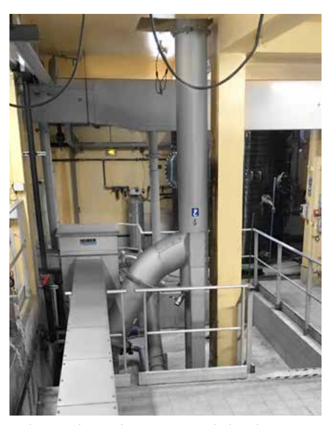
Underground screenings system, vertical wash press discharge with downstream Ro8 V.