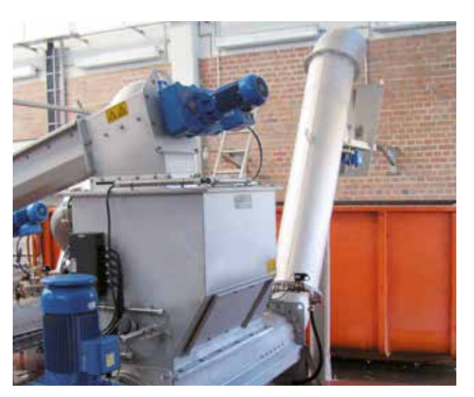
HUBER Screw Conveyor Ro8 T discharging screenings into a HUBER Wash Press WAP® SL.