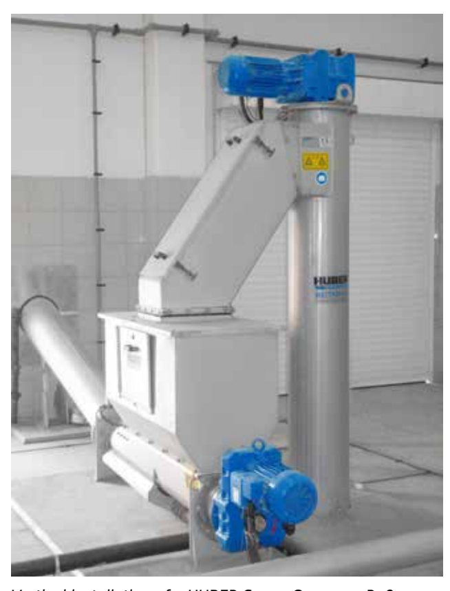
Vertical installation of a HUBER Screw Conveyor Ro8 discharging screenings into a HUBER Wash Press WAP®.