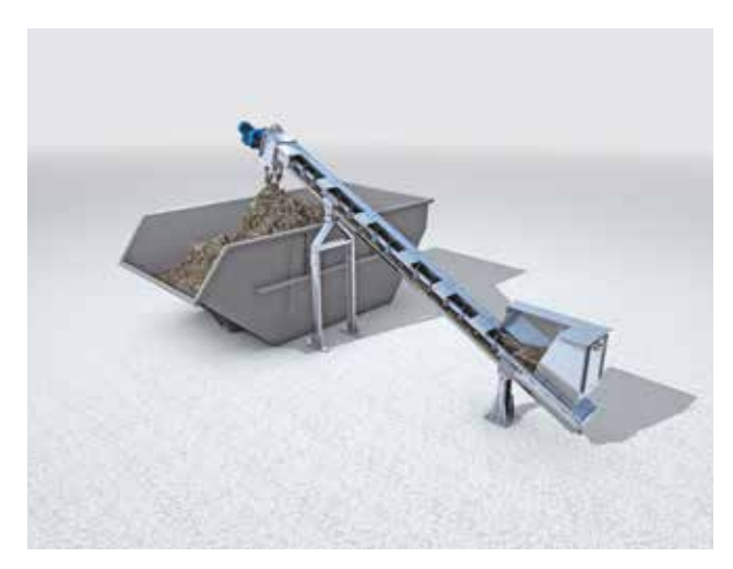
Graphic illustration of a HUBER Screw Conveyor Ro8 T.

The HUBER Pipe Screw Conveyor Ro8 features with guide bars and can be installed at an angle of up to 90° depending on the individual product to be conveyed. The design of the Ro8 screw conveyor allows the screw to be mounted on both sides to guarantee low levels of wear during operation.