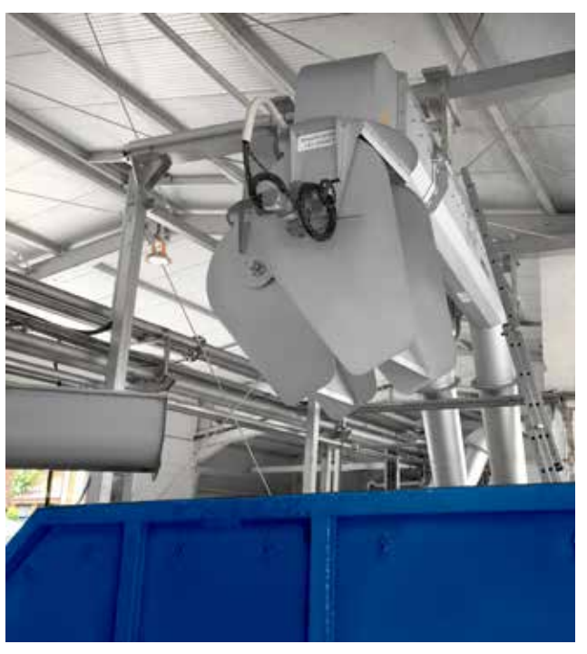
Open distribution chute for screenings in tip mode.