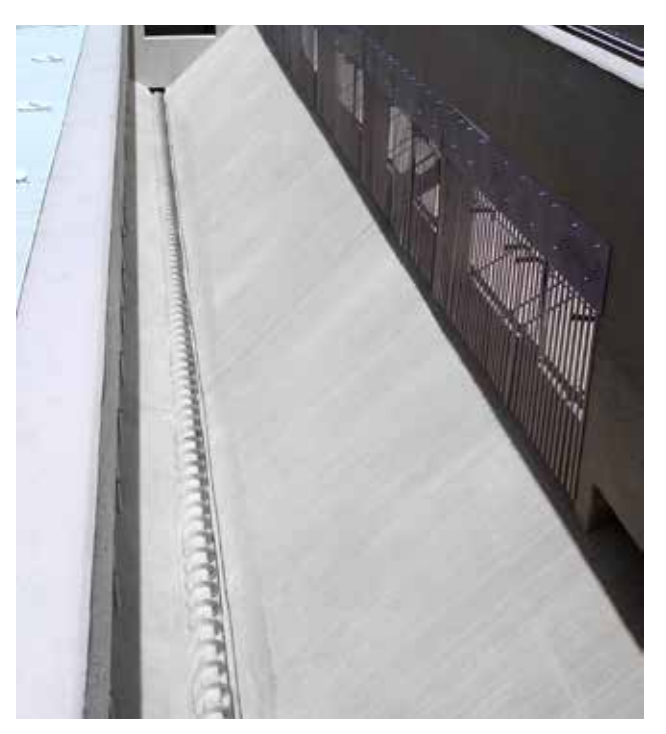
HUBER Trough Screw Conveyor Ro8 T as grit removal screw in a longitudinal grit trap.