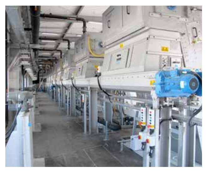
Redundant conveyor using a double trough diverter.