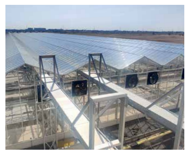
HUBER Trough Screw Conveyor Ro8 T as supplying conveyor bridge to a HUBER Solar Sludge Dryer .