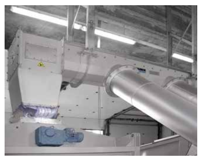
Ceiling-mounted distributor for pressed screenings with two end discharge units.

In addition to fixed, ceiling-mounted distributors, rotating distribution screws are also used to ensure an even supply of containers, especially in the sludge disposal sector.