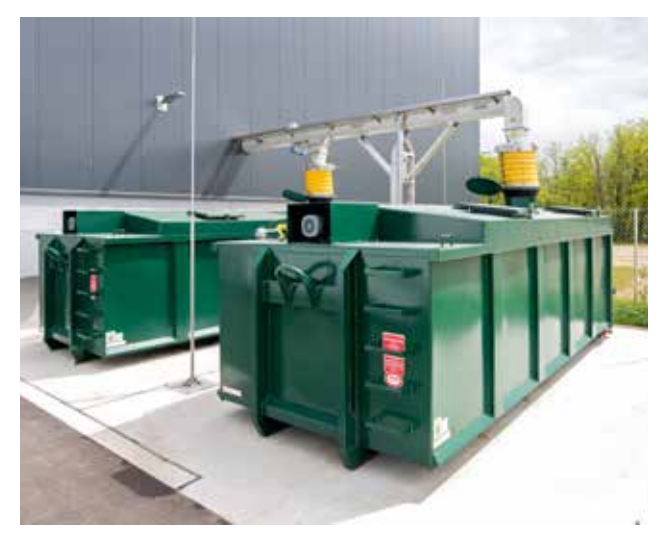
HUBER Trough Screw Conveyor Ro8 T for a fully enclosed disposal solution with loading bellows.