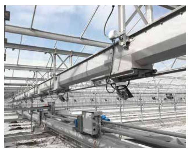
Distribution conveyor to supply sludge to a HUBER Sludge Turner SOLSTICE®. 55 m conveyor length, 16 discharge points.