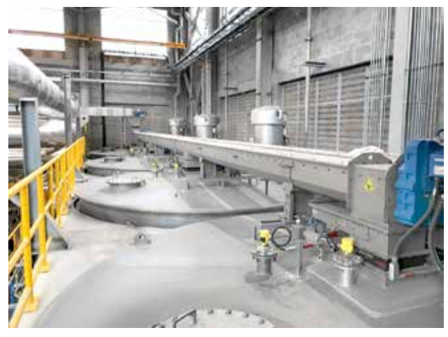
Horizontal transport of dried sewage sludge.