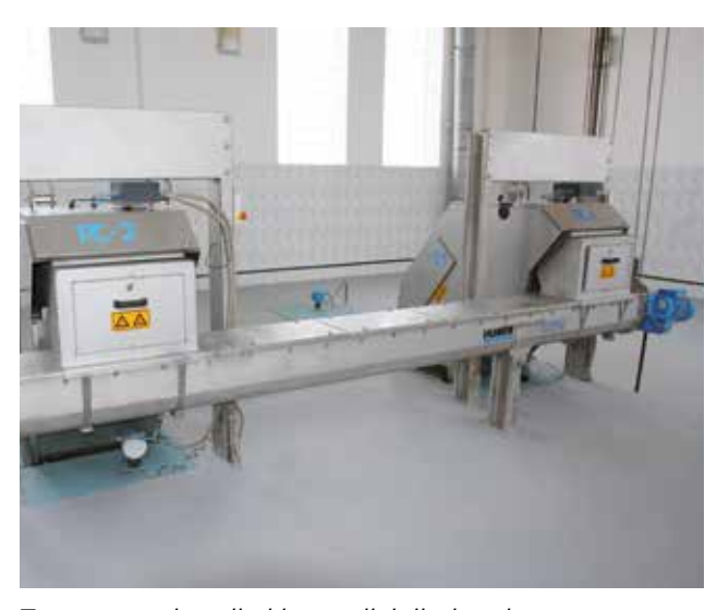
Two screens installed in parallel discharging into a screw conveyor.