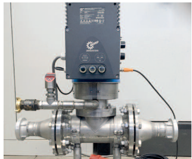
Mobile test unit of a HUBER Inline Polymer Mixer IPM