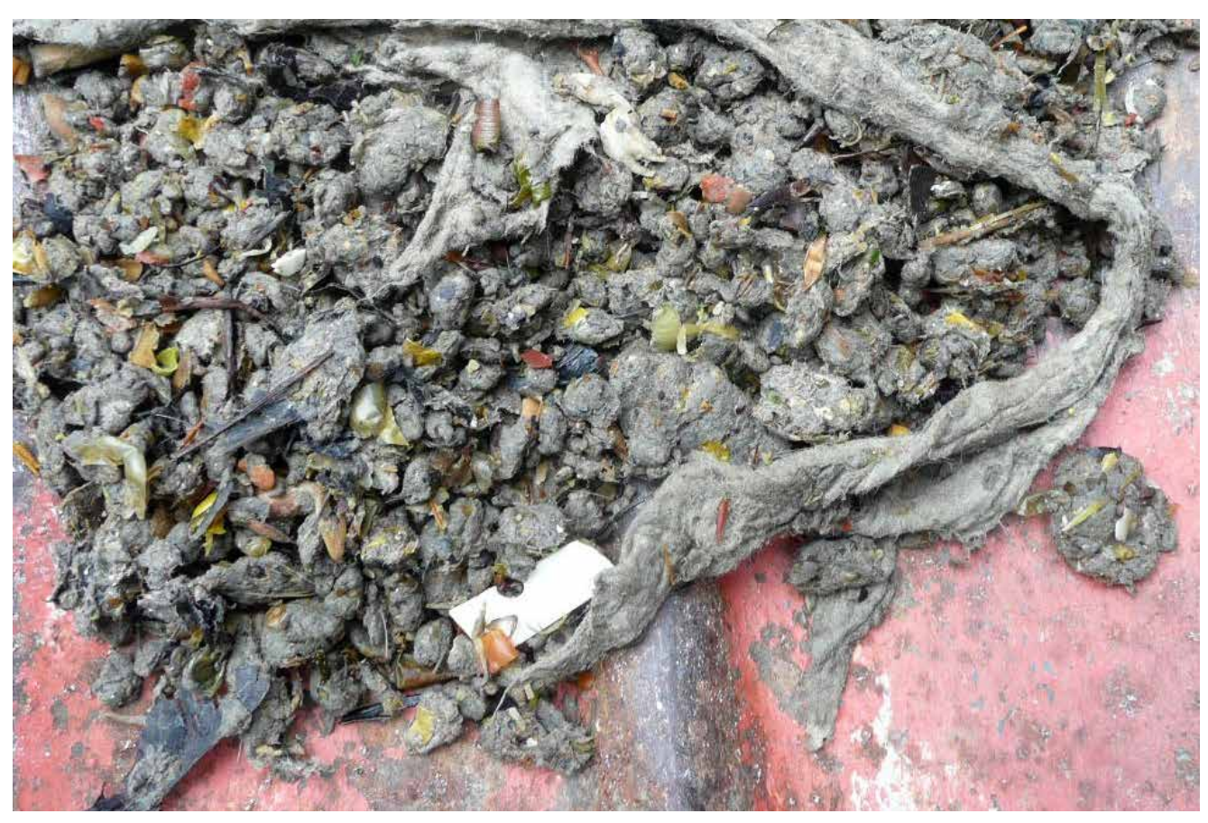
Separated material: wet wipes, leaves, plastics, foils, packaging residues, textiles, etc.