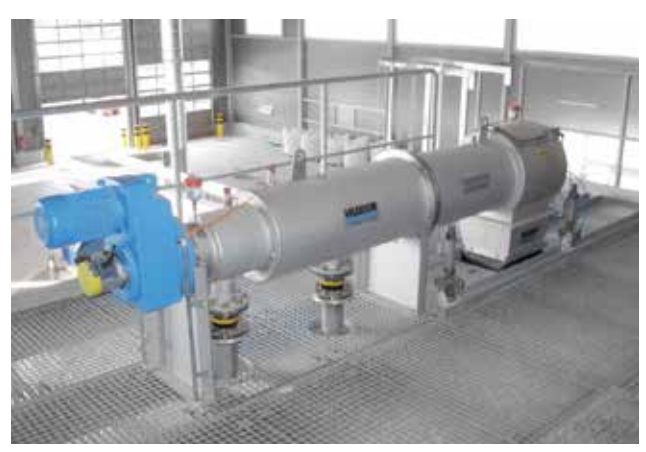
HUBER Sludgecleaner STRAINPRESS® applied for fermentation residue screening.