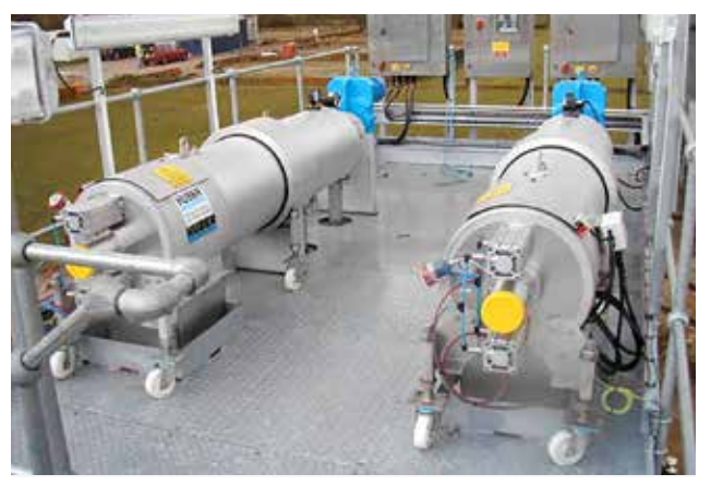
STRAINPRESS® with heatable casing pipe.