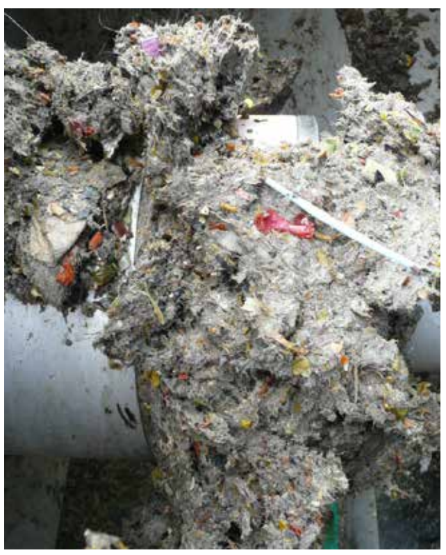
Discharge of the separated dewatered material.