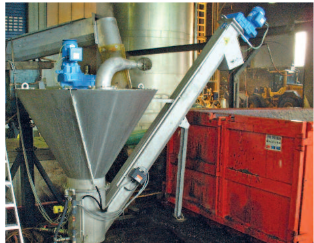
Special design for the treatment of sediments from biogas plants