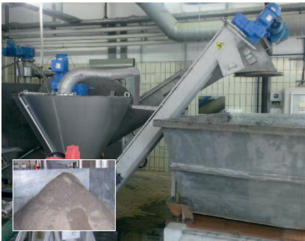
Grit washer installation on a municipal sewage treatment plant