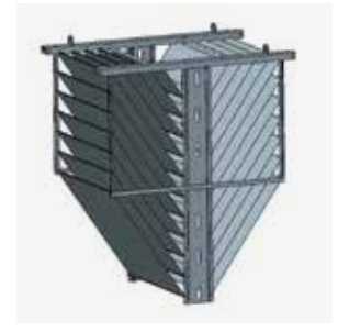
Lamella unit installed in the HUBER Grit Trap GritWolf®.