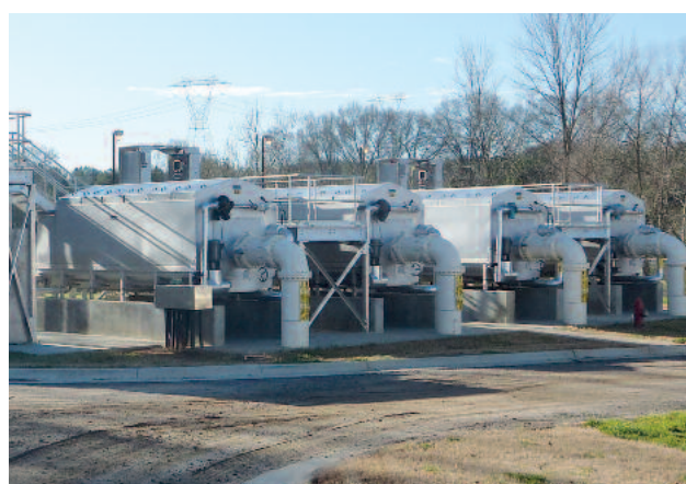
4 RoDisc® Rotary Mesh Screen units with 18 discs installed in a concrete tank