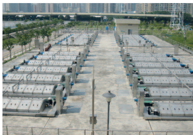
28 RoDisc® Rotary Mesh Screen units with 24 discs each treating about 8.5 m 3 wastewater per second