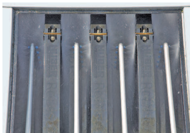
Backwashing of filter discs with filtrate – no external wash water required