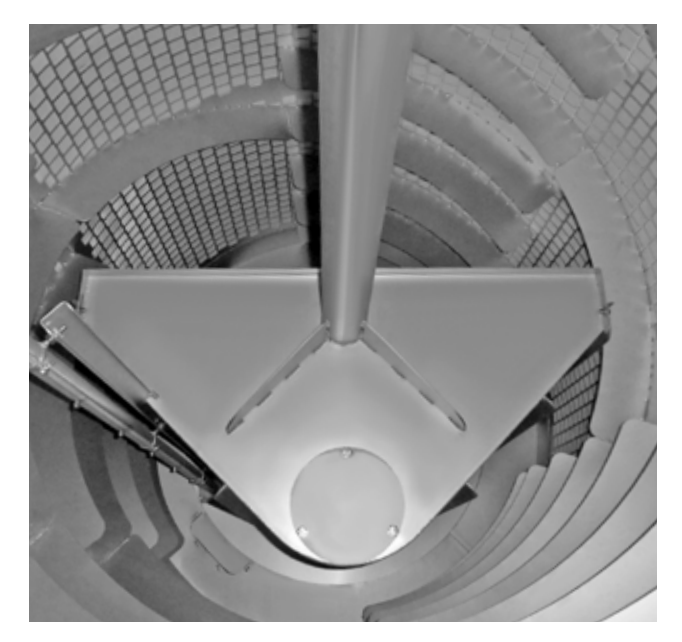
HUBER Drum Screen RoMesh<sup>®</sup> for optimal separation of very fine particles.