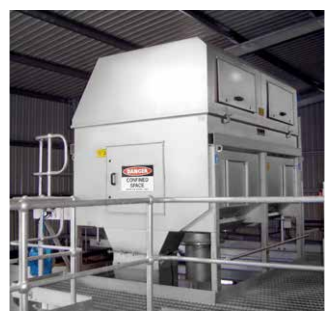
Installation of a HUBER Drum Screen RoMesh® for industrial wastewater treatment.