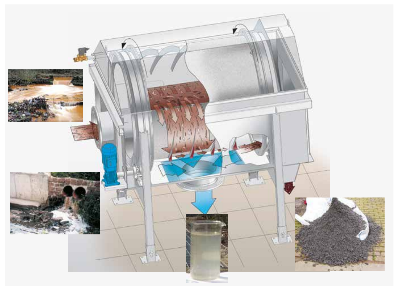
Schematic drawing of the HUBER Drum Screen RoMesh®.