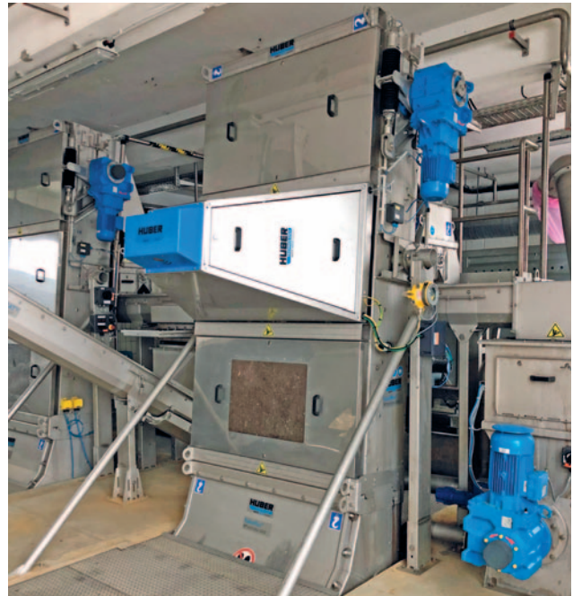
Figure 1: HUBER Safety Vision installed on a HUBER Multi-Rake Bar Screen RakeMax®

In addition to the type of material to be expected, however, other unforeseen materials are increasingly entering the sewage treatment plant influent, such as canisters, square timbers and tyres. Even though screening plants are built for coarse and bulky material, such matter can cause damage, resulting in longer downtimes, higher costs and, above all, additional stress. To prevent this, HUBER has developed a worldwide unique system for wastewater screens: the HUBER Detection System Safety Vision .