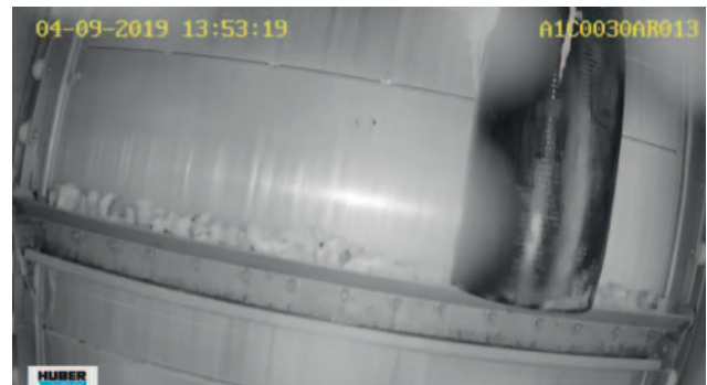
Figure 2: Exemplary image for operator notification - pipe sealing cushion on the rake bar of a HUBER Multi-Rake Bar Screen RakeMax®

Based on this message, the operator can decide individually whether the screen should continue to be operated or should stop until the debris is removed. This effective protection mechanism reliably prevents damage to the screen or the downstream equipment, which not only increases the availability of the machines involved, but also improves the operational safety of the entire plant technology.