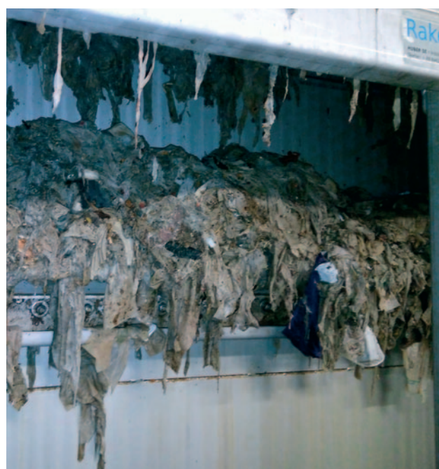
Figure 3: High pollution load on a rake bar