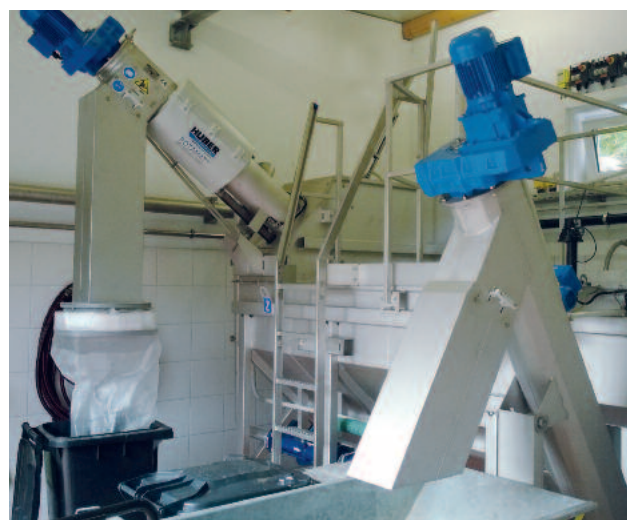
Complete Plant with integrated grit washer