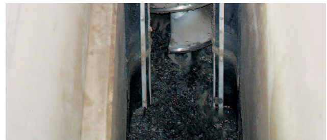
HUBER Micro Strainer ROTAMAT® Ro9 XL with lower maintenance-free ceramic bearing