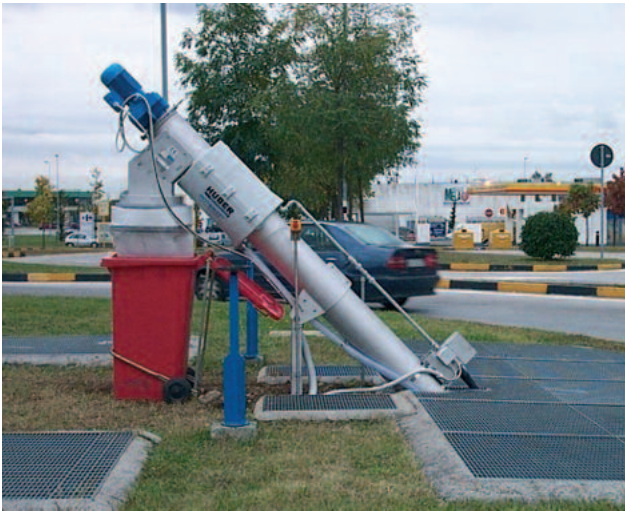
HUBER Micro Strainer ROTAMAT® Ro9 installed in the middle of a roundabout