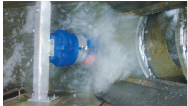
External screenings washing system (ERGA). A preceding washing system washes out the organic matter.