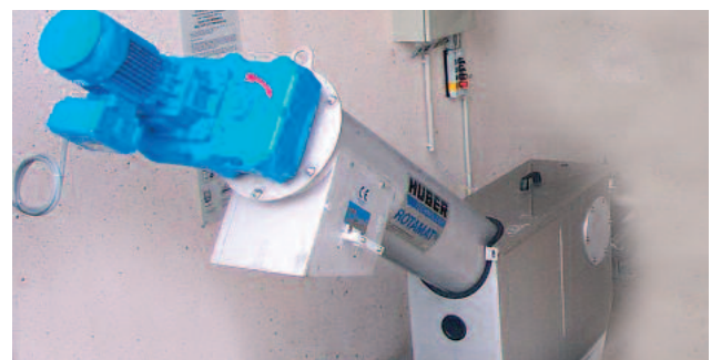
Tank-mounted HUBER Micro Strainer ROTAMAT® Ro9 EC