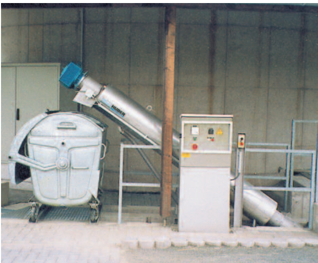
Outdoor installation of a HUBER Micro Strainer ROTAMAT® Ro9