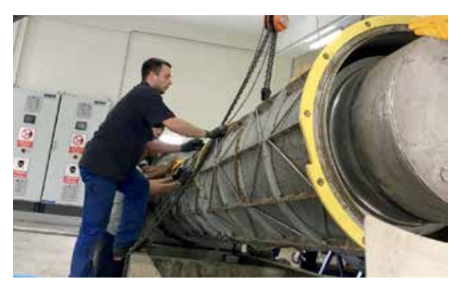
Use of resources - for the sake of sustainability.