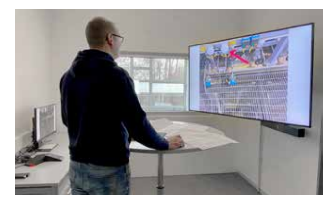
Remote support - not on site, yet there with you live.