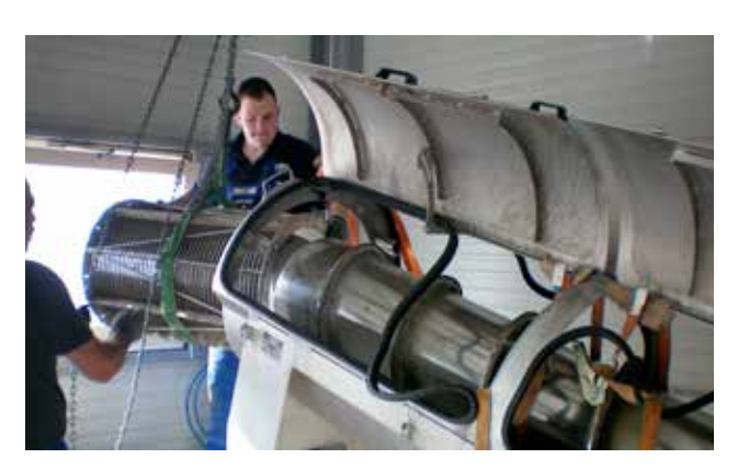
Efficient and professional execution.