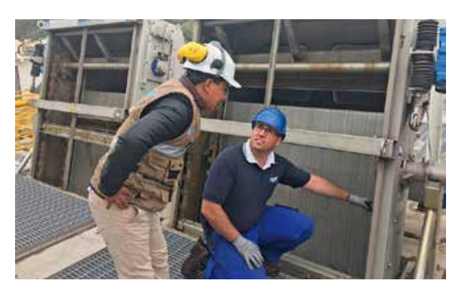
Customer proximity is our highest priority – on-site con sultancy by HUBER experts.