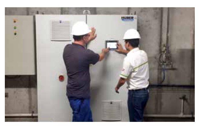
Transfer of know-how to the operating personnel for optimum operation of the entire system.