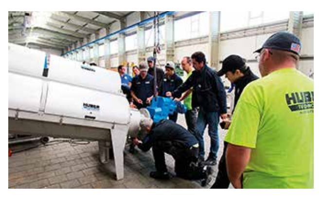
Technical and specialist expertise to optimally develop your employees with the latest qualifications.