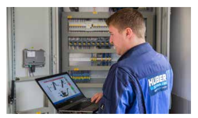
Expert support for the optimal operation of your plant.