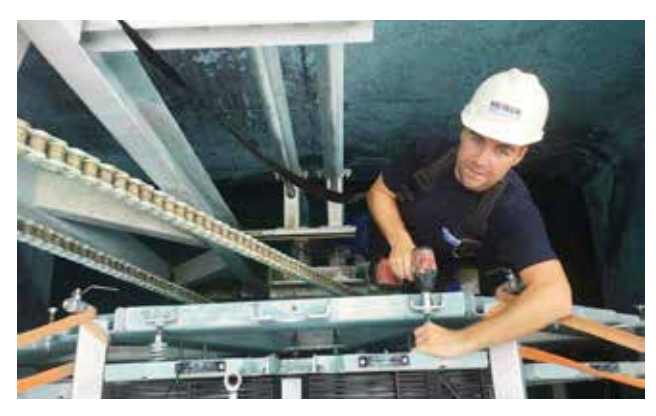
Successful start of operation due to professional installation.