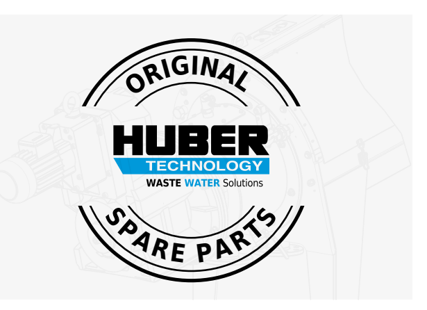
Specially developed for the flawless operation of your machine.

Only original HUBER spare parts meet all requirements for optimal use in your HUBER machine.