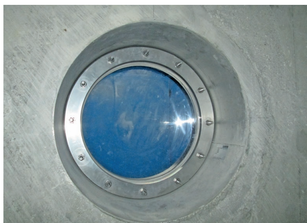
The figure shown here may contain special accessories

Sight glass in the bottom of water tanks, pressure-tight up to a water gauge of 10 m.