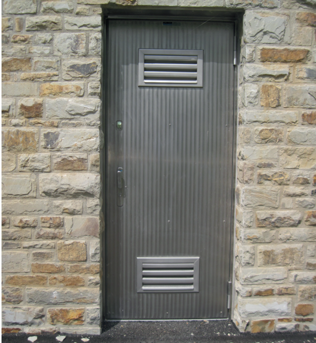
The figure shown here may contain special accessories

Security class RC4 is recommended by the criminal investigation department if the building is not secured by means of a burglar alarm system.