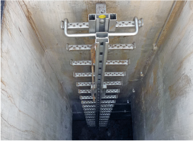
The figure shown here may contain special accessories

Safety climbing device , with design certification and CE marking; according to UVV regulations ladders with 3 m or 5 m height of fall must be equipped with devices that protect personnel against falls from a height; in accordance with DIN EN 14396, made of 1.4307 (AISI 304 L) stainless steel.