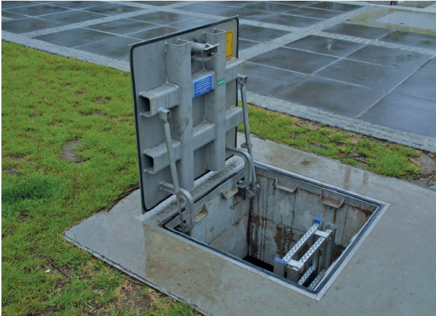
The figure shown here may contain special accessories

Insettable entrance aid , with design certification in accordance with DIN 19572, made of 1.4307 (AISI 304 L) stainless steel, for safety access ladders with 300 mm, 400 mm, 500 mm width.