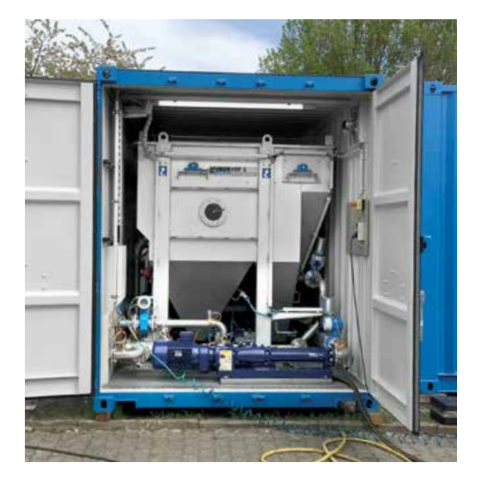
HUBER plant technology in container design – flotation or sludge dewatering units without construction work – ready for immediate use.