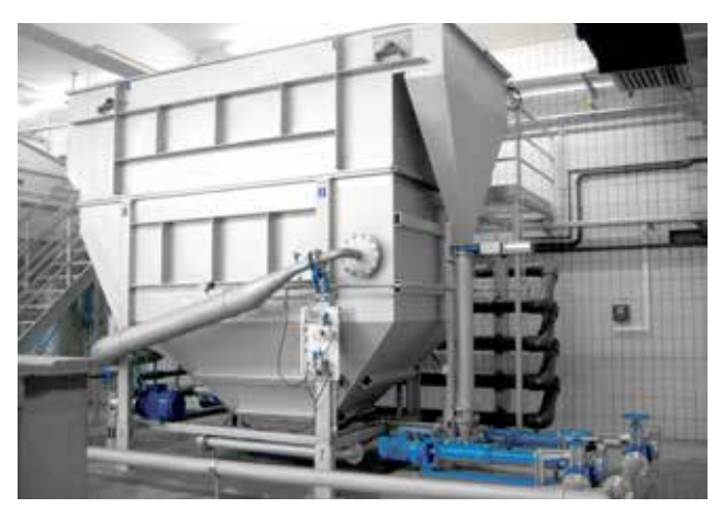
HUBER Dissolved Air Flotation for physical-chemical pre-treatment – optimum reduction of COD, fats and solids, more than 500 installations worldwide.