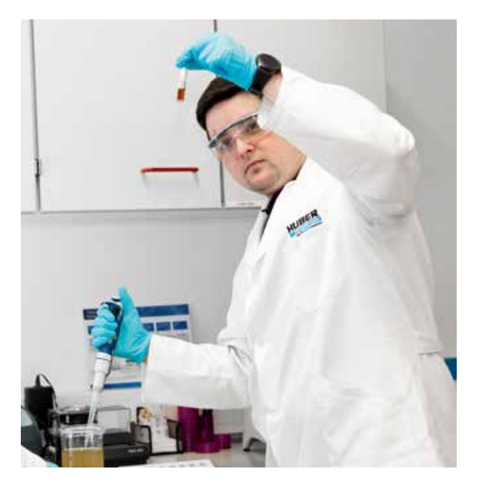
Preliminary tests in the laboratory or on site to determine operating parameters and effluent values – safety for customers and operators.