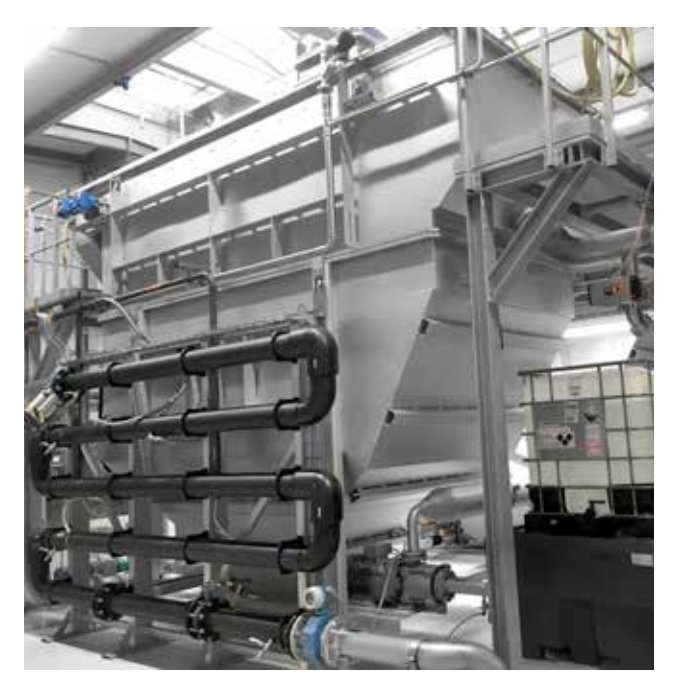
HUBER Dissolved Air Flotation Plants with chemical pre-treatment – full, partial or secondary treatment of industrial wastewater