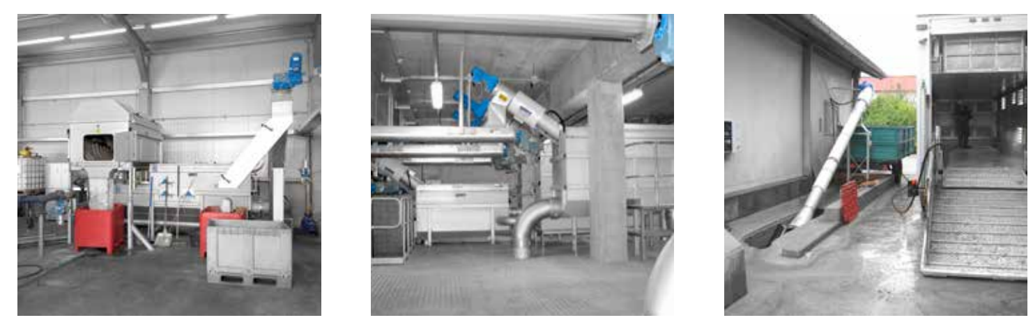
HUBER screening systems for best possible and project-specifically adapted mechanical pre-treatment – efficient, durable and well proven.