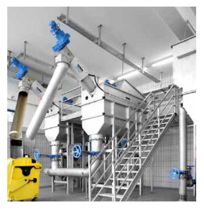
HUBER Rotary Drum Fine Screen ROTAMAT<sup>®</sup> Ro2 with high-pressure cleaning – best cleaning results and adapted machine technology.