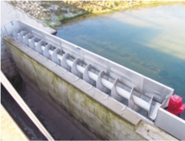
ROTAMAT® Storm Screen RoK1 installed at an overflow weir.

A selection of installation examples will convince you of the HUBER ROTAMAT® Storm Screen RoK1: