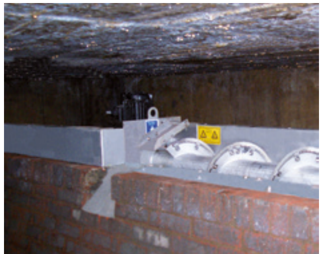
Return of screenings into the sewer.

RoK1 screens are horizontally installed at the downstream side of overflow weirs. A screw flight is mounted on a half cylinder of perforated plate. As the stormwater flows through the horizontal perforated half-pipe of the screen trough the solids are retained. A screw, with a brush attached on its flights, rotates within the semi-circular screen trough. It cleans the screen and pushes the screenings gently towards the end of the trough. At the end of the trough, the screenings are returned into the sewer and carried to the wastewater treatment plant. Alternatively, the screenings are removed from the plant with a cross conveyor for further disposal. During storm conditions the screen is automatically started and then works fully automatically.