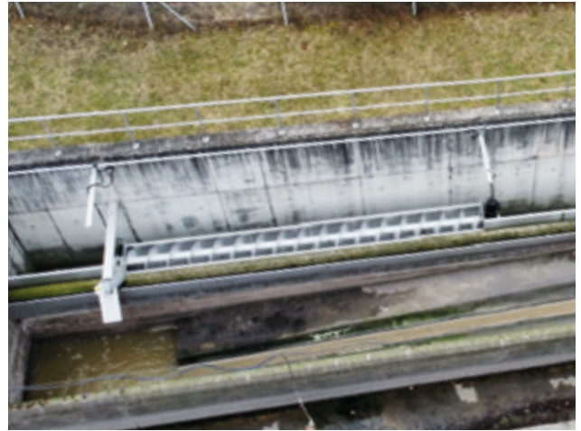
HUBER Storm Screen ROTAMAT® RoK1 TS with a cross conveyor for high solids loads.