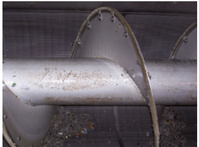
Gentle automatic cleaning of the semi-circular perforated plate.

The ROTAMAT® RoK1 screen is the ideal solution for this task, whether for new structures or refurbishment. The screen belongs to a group of fine screens designed for high flow rates at an extremely low hydraulic resistance. Two-dimensional screening guarantees a very high solids retention combined with automatic, gentle cleaning of the perforated plate.