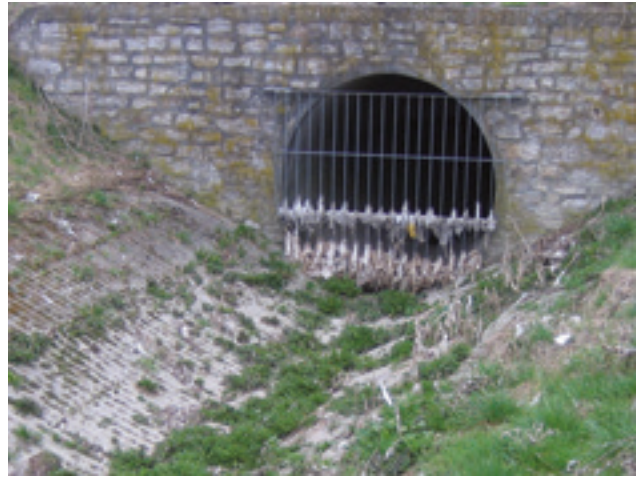
Unsightly matter discharged during storm events, typical for stormwater discharges without coarse material retention.

During and after storm events large amounts of debris are discharged to streams, rivers and lakes through storm water overflows of combined and sanitary sewer systems. Frequently, even the installation of scum boards is insufficient to prevent such pollution. The polluting items, such as sanitary products, toilet paper, faeces, plastic foils, etc. are not only unsightly but also responsible for considerable cleaning and/or disposal costs. On the basis of the DWA sheet A 102 (an instruction issued by an association dealing with wastewater treatment) efforts to fundamentally improve the protection of waters in this sector have been increased. Particularly endangered receiving water courses and nature preservation areas require more extensive measures concerning the treatment of stormwater.