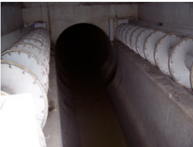
ROTAMAT® RoK1 screens installed at an angle of 60° on both sides of an overflow.