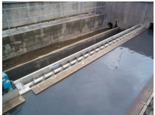
HUBER ROTAMAT® Screen RoK1 installed in a stormwater discharge channel.