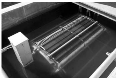
HANS HUBER AG