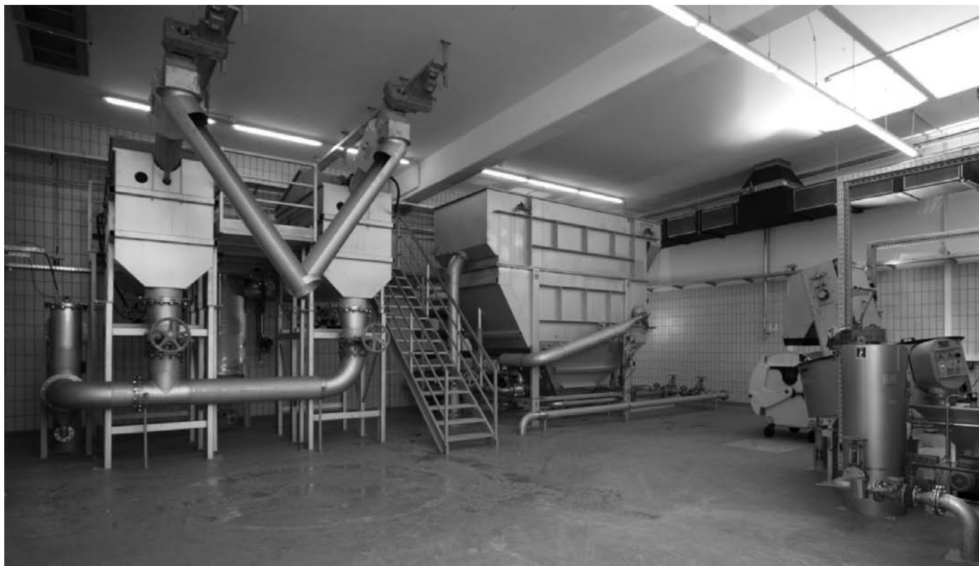
HANS HUBER AG