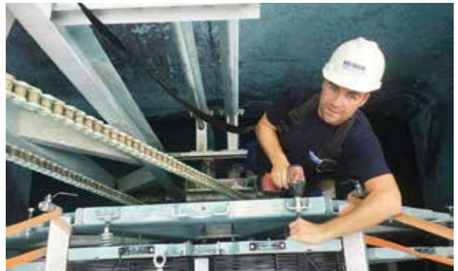
Successful start of operation due to professional installation.