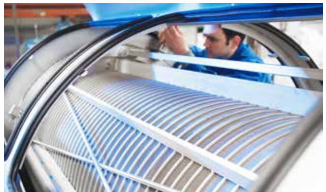
Complete overhaul at our HUBER factory.