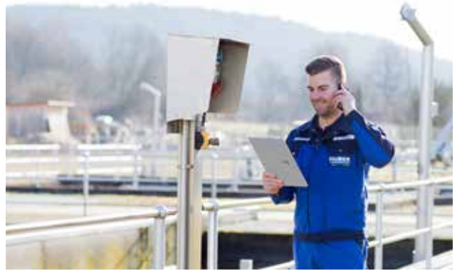
Specialists on site for you.