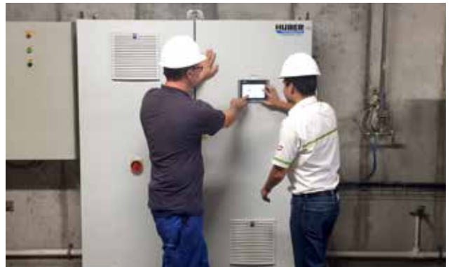
Transfer of know-how to the operating personnel for optimum operation of the entire system.