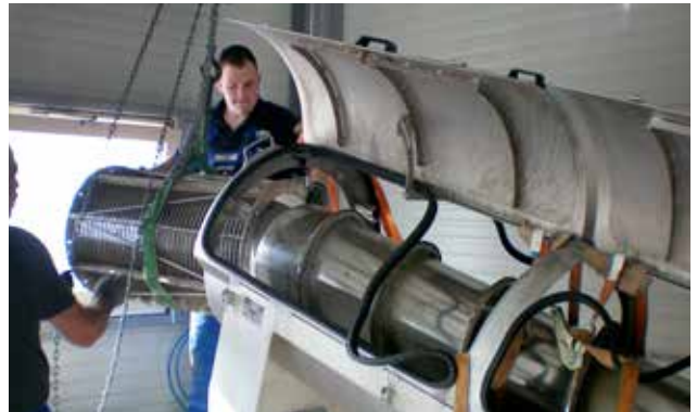
Efficient and professional execution.