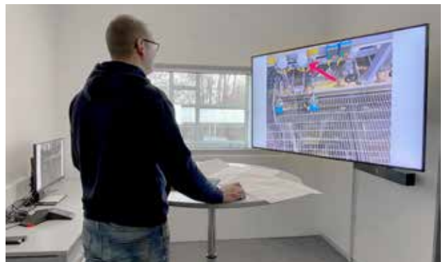
Remote support – not on site, yet there with you live.