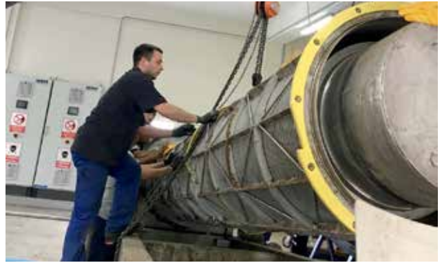
Use of resources – for the sake of sustainability.