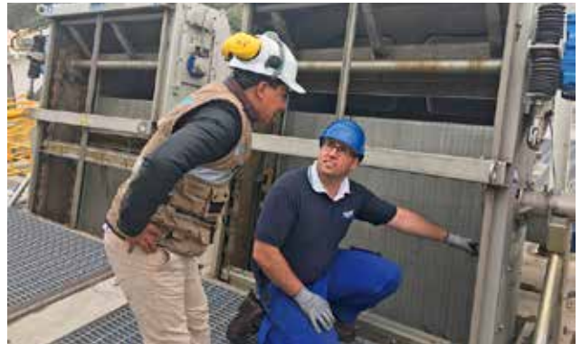
Customer proximity is our highest priority – on-site consultancy by HUBER experts.