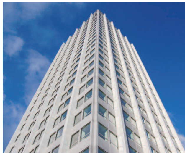
Climatisation of the Winterthur Wintower building with the HUBER ThermWin® system