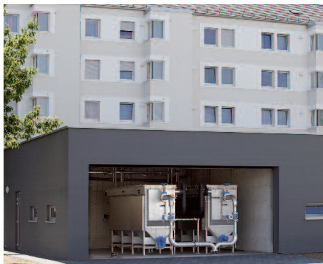
Heat station Straubing

The connection from the heat station to the sewer system and building should be as short as possible to minimise investment and operating costs.