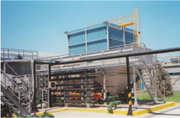
PEPSICO / Argentina: food processing ROTAMAT® Micro Strainer Ro 9, HUBER Dissolved Air Flotation Plant HDF-75 with chemical treatment, throughput: 70-80 m³/h