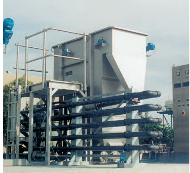
Slaughterhouse Medinat Zaved, U.A.E. ROTAMAT® Micro Strainer Ro9, HUBER Dissolved Air Flotation Plant HDF-1, throughput: 10 m 3 /h