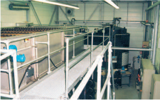
Slaughterhouse Hinwil / Switzerland ROTAMAT® Rotary Drum Fine Screen Ro 2, HUBER Dissolved Air Flotation Plant HDF-50 with chemical treatment, throughput: 50 - 60 m 3 /h, ROTAMAT® Screw Press RoS 3, throughput: 5 m 3 /h