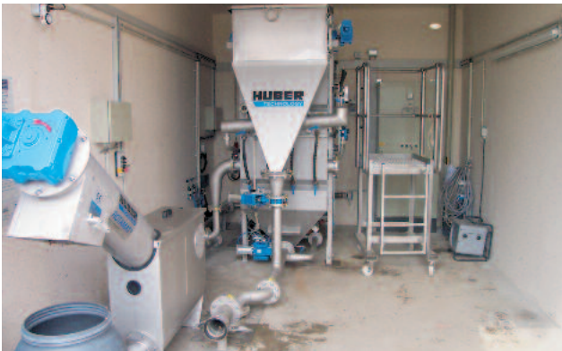
Butchery Walk / Germany: meat processing ROTAMAT® Micro Strainer Ro 9 in tank, HUBER Dissolved Air Flotation Plant HDF-1 without chemical treatment, throughput: up to 10 m 3 /h