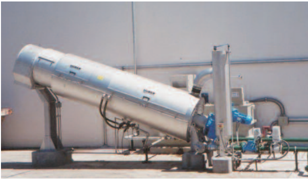
PEPSICO / Argentina: food processing ROTAMAT® Screw Press RoS 3, throughput: 5 - 10 m³/h