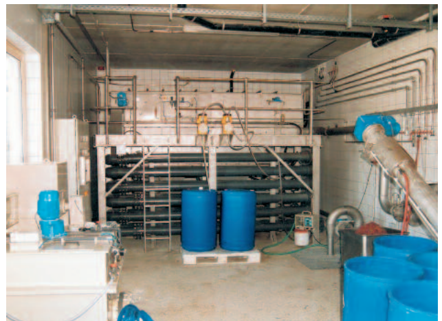
Slaughterhouse Ingolstadt / Germany Top: ROTAMAT® Micro Strainer Ro 9, HUBER Dissolved Air Flotation Plant HDF-3 with chemical treatment, throughput: 30 m³/h Left: Truck washing with ROTAMAT® Micro Strainer Ro 9 in tank, final DS > 35 %