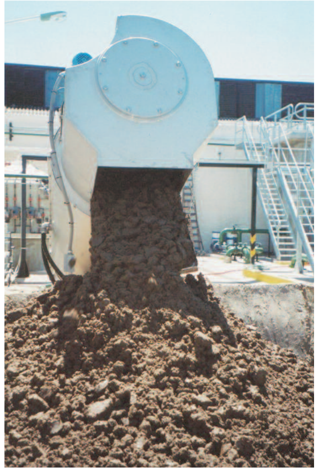
PEPSICO / Argentina: food processing, Discharging ROTAMAT® Screw RoS 3, Final DS: 25 - 30 %