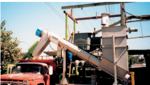
Slaughterhouse Carnes Darc / Chile ROTAMAT® Paunch Manure Press Ro 7a, throughput: up to 90 head of cattle per hour