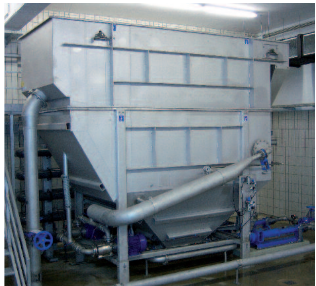
Hans Kupfer & Sohn GmbH Co. KG / Germany HUBER Dissolved Air Flotation Plant HDF-10 with chemical treatment stage, throughput: 100 m 3 /h