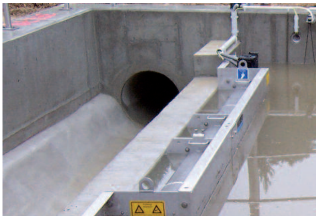
HUBER ROTAMAT® Storm Screen RoK 2 before overflow

A selection of installation examples will convince you of the HUBER ROTAMAT® Storm Screen RoK 2