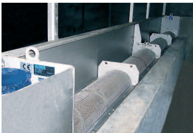
View of the downstream side of a ROTAMAT® Storm Screen RoK 2