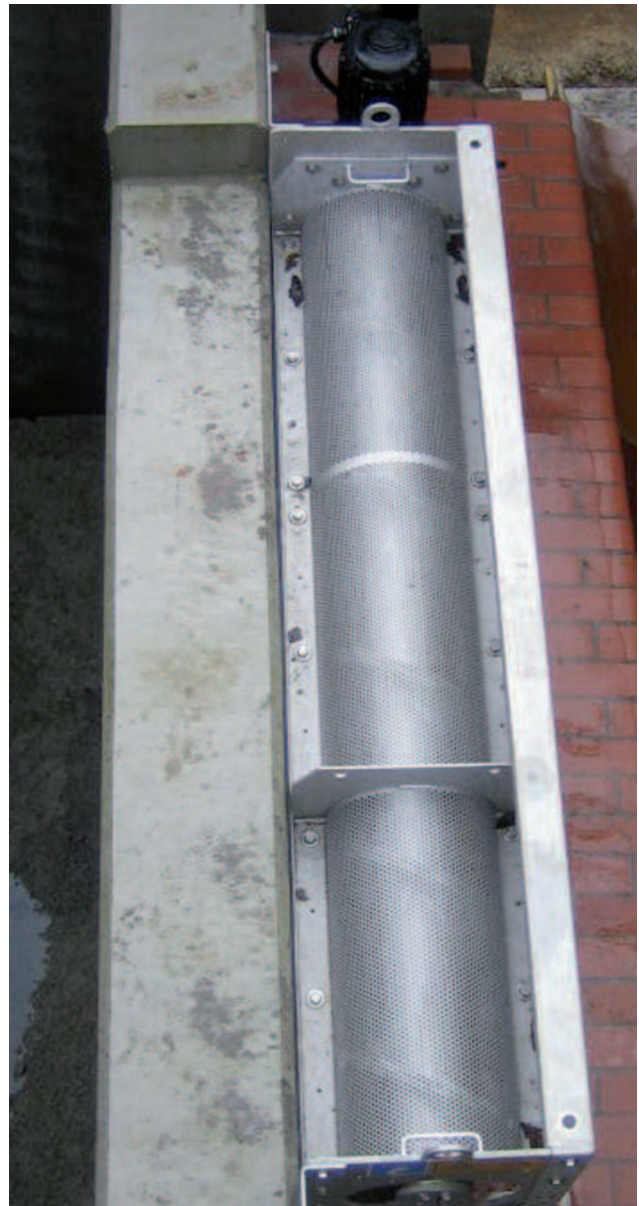
ROTAMAT® Storm Screen RoK 2 installed at a stormwater discharge

RoK 1 screens are horizontally installed at the upstream side of overflow weirs. A screw flight is mounted on a half cylinder of perforated plate. As the stormwater flows through the horizontal perforated half-pipe of the screen through the solids are retained. A screw, with a brush attached on its flights, rotates within the semi-circular screen trough. It cleans the screen and pushes the separated solids gently towards the lateral discharge. The screenings remain on the polluted water side of the screen from where they are taken along with the wastewater flow. During storm conditions the screen is automatically started and then works fully automatically.