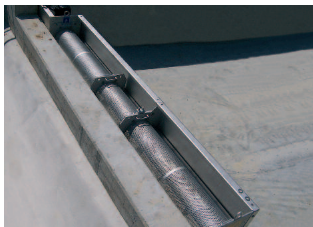
ROTAMAT® Storm Screen RoK 2 after completed installation

To avoid another point of maintenance it is generally not intended to remove screenings from the structure. Instead, the screenings remain within the sewer or tank and are introduced into the wastewater treatment plant after the storm event.