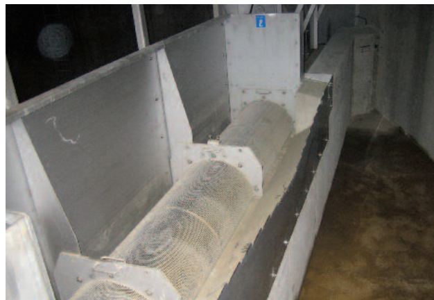
ROTAMAT® Storm Screen RoK 2 with an integrated gauging weir for overflow measurement