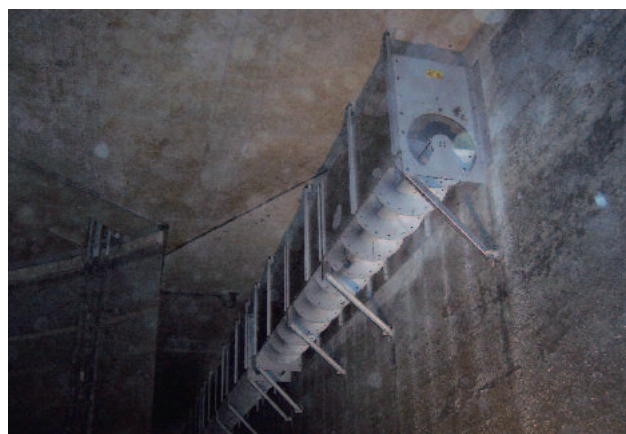
View of the upstream side and lateral screenings discharge opening