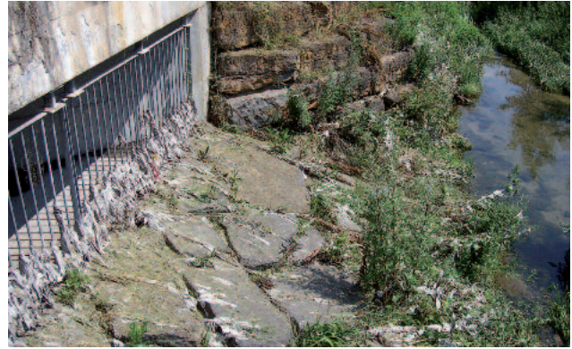
Unsightly matter discharged during storm events, typical for stormwater discharges without coarse material retention

During and after storm events large amounts of debris are discharged to streams, rivers and lakes through storm water overflows of combined and sanitary sewer systems. Frequently, even the installation of scum boards is insufficient to prevent such pollution. The polluting items, such as sanitary products, toilet paper, faeces, plastic foils, etc. are not only unsightly but also responsible for considerable cleaning and/or disposal costs. On the basis of the DWA sheet A 128 (an instruction issued by an association dealing with wastewater treatment) efforts to fundamentally improve the protection of waters in this sector have been increased. Particularly endangered receiving water courses and nature preservation areas require more extensive measures concerning the treatment of stormwater.