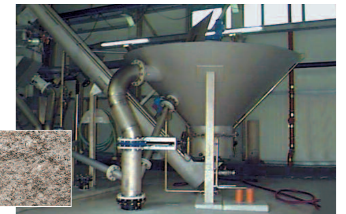
Washed grit from COANDA Grit Washer with < 3% loss on ignition, particle size up to 10 mm, DR > 90%