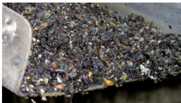
Untreated grit from STPs