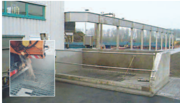
Acceptance tank with bar grate and integrated vertical dosing screw