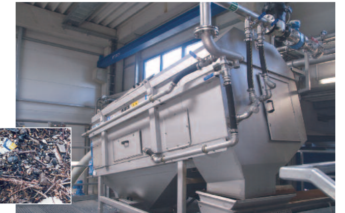
ROTAMAT® Wash Drum for washout and separation of all coarse material > 10 mm