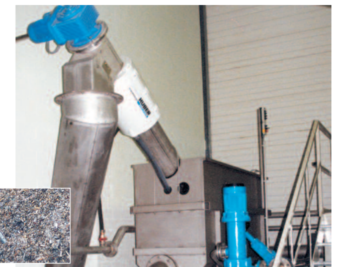
ROTAMAT® fine screen for 1 mm screening and dewatering of organic material (approx. 30% DR)