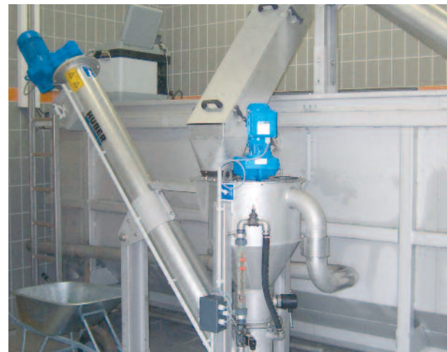
A small HUBER Grit Washer RoSF 4/tC washing the classified grit from a ROTAMAT® Complete Plant Ro 5