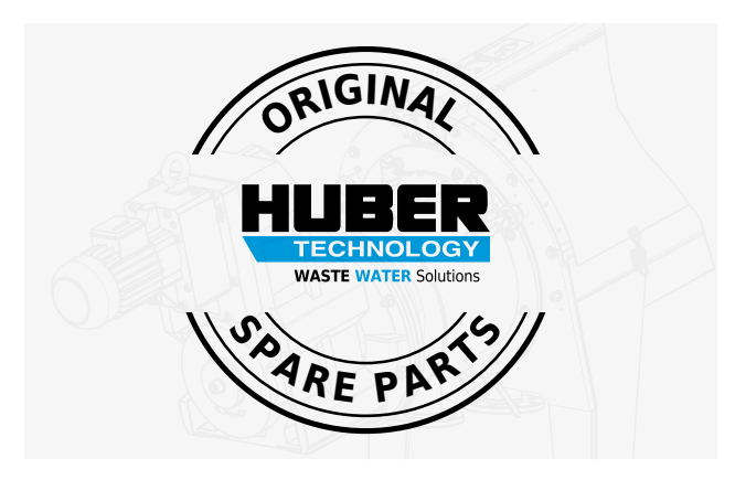
Specially developed for the flawless operation of your machine.