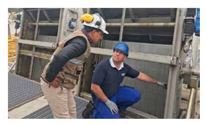
Customer proximity is our highest priority – on-site consulting from HUBER experts.