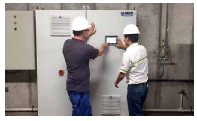
Transfer of know-how to the operating personnel for optimum operation of the entire system.