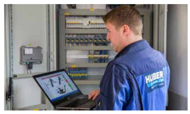
Expert support for the optimal operation of your plant.