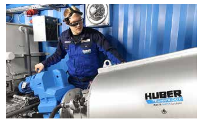
Sharing expert knowledge effectively and remotely.