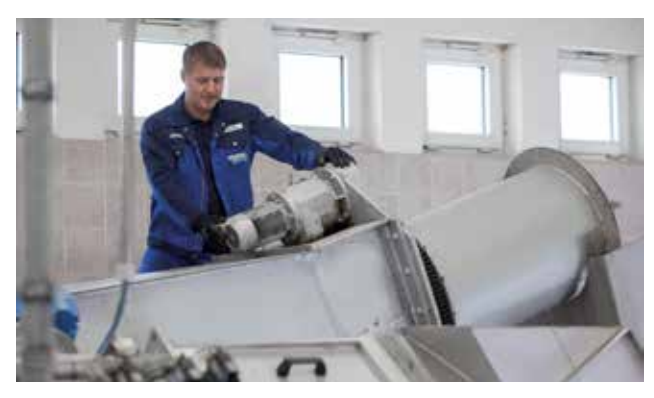
Comprehensive service expertise from a single source.