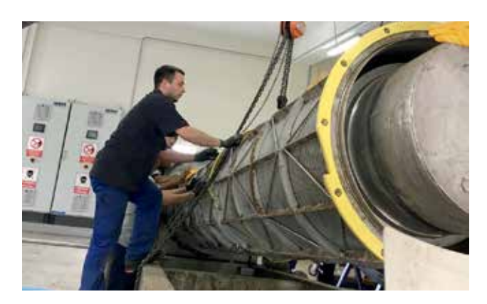
conserving resources - in the spirit of sustainability.