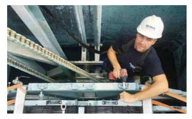
Successful start of operation due to professional installation.