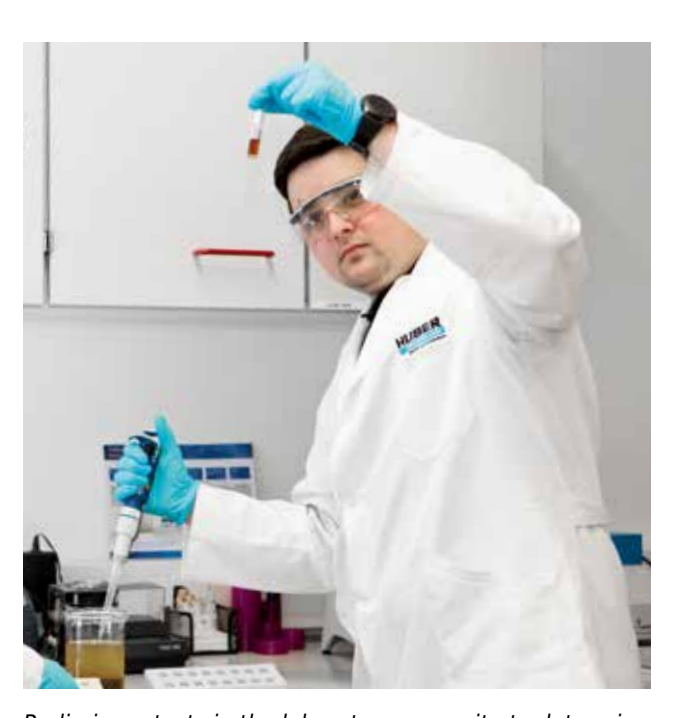
Preliminary tests in the laboratory or on site to determine operating parameters and effluent values – safety for customers and operators.