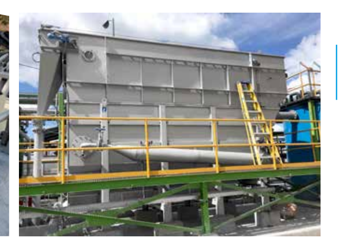
HUBER Dissolved Air Flotation for physical-chemical pre-treatment – optimum reduction of COD, fats and solids, more than 500 installations worldwide.