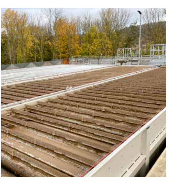
HUBER Dissolved Air Flotations Plants with chemical stage for secondary treatment – the solution to relieve overloaded biological treatment plants.