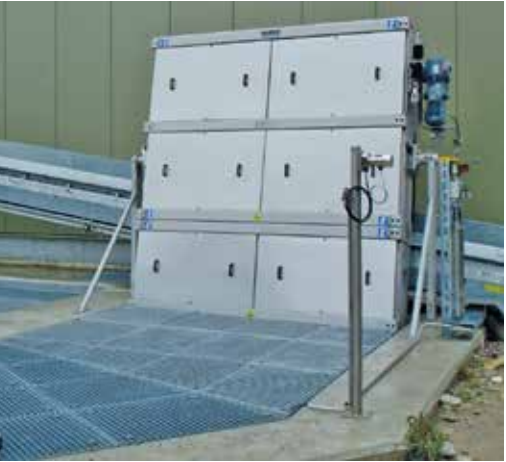
HUBER screening systems for best possible and project-specifically adapted mechanical treatment of wastewater and surface water – efficient, durable and well proven.