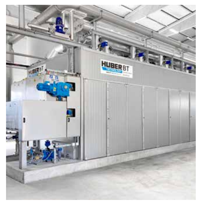
HUBER Belt Dryer BT for sludge drying – best drying results and maximum reduction of disposal costs.