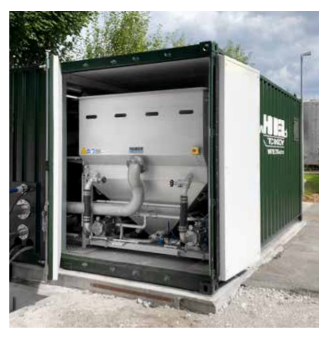
HUBER plant technology in container design – flotation or sludge dewatering units without construction work – ready for immediate use.