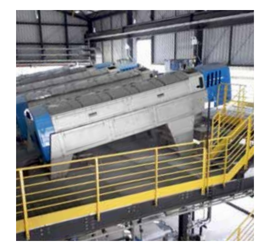
HUBER Screw Press units for sludge treatment – best dewatering performance and highest volume reduction for lower disposal costs.