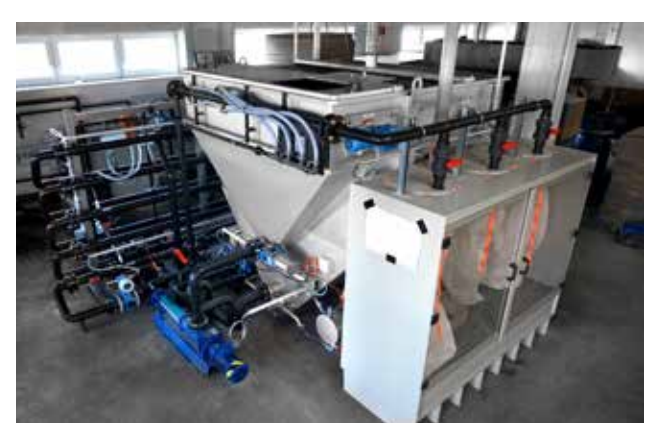
HUBER Pressure Relief Flotation HDF for process wastewater treatment in leather factories.