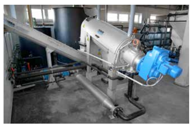
HUBER Screw Press Q-PRESS<sup>®</sup> for process sludge dewatering in tanneries.